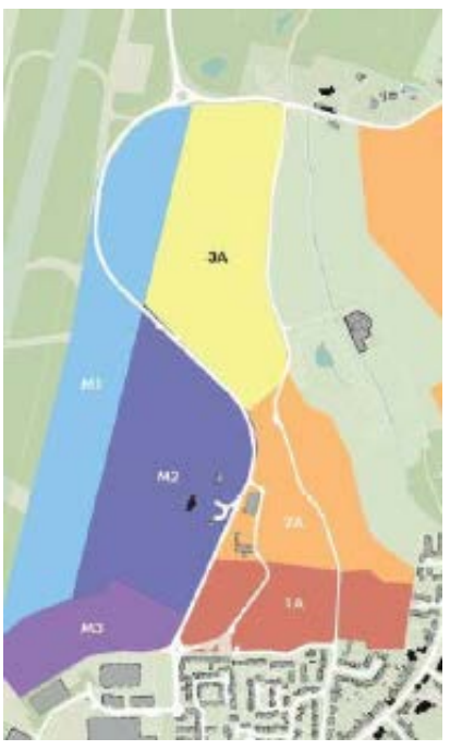
Figure 3.2 Extract of Masterplan from December 2017 Employment Site Audit

An alternative proposal for a smaller employment (or housing site) was dismissed without evidence