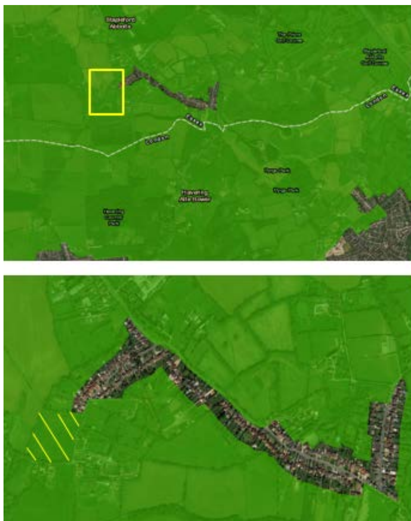
Figure 6: Land to the West of Bournebridge Lane – Relationship to Green Belt

The current designation of the site is agricultural land and, whilst the site lies within the Green Belt, it adjoins the boundary of the Green Belt and the designated settlement boundary of Stapleford Abbots, as shown in Figure 6 below.