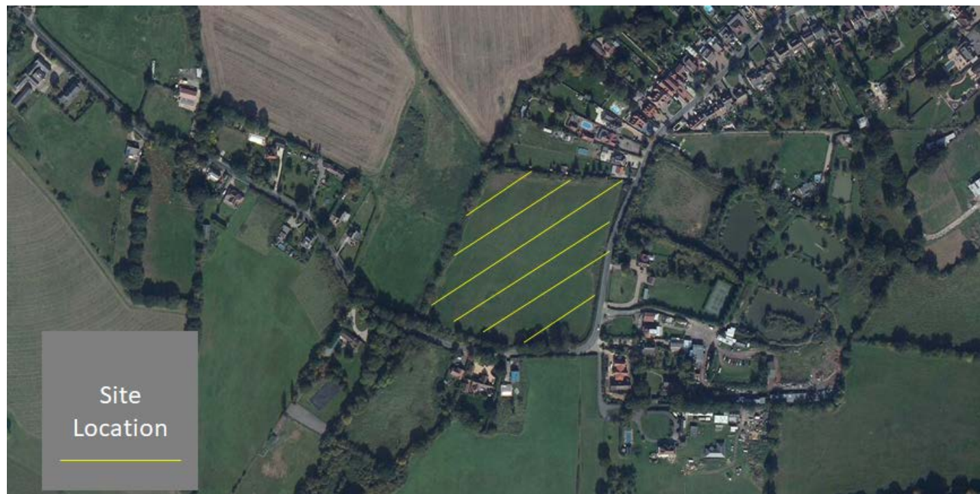
Figure 5: Land to the West of Bournebridge Lane

We would like to put forward the 2.75 hectare site to the West of Bournebridge Lane (shown in Figure 5 below, .....Redacted..... .....Redacted.....) to be considered for a new housing allocation.