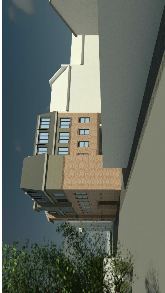
Street View 2

DO NOT SCALE REPORT ERRORS AND OMISSIONS TO THE ARCHITECT CHECK ALL DIMENSIONS BEFORE FABRICATION