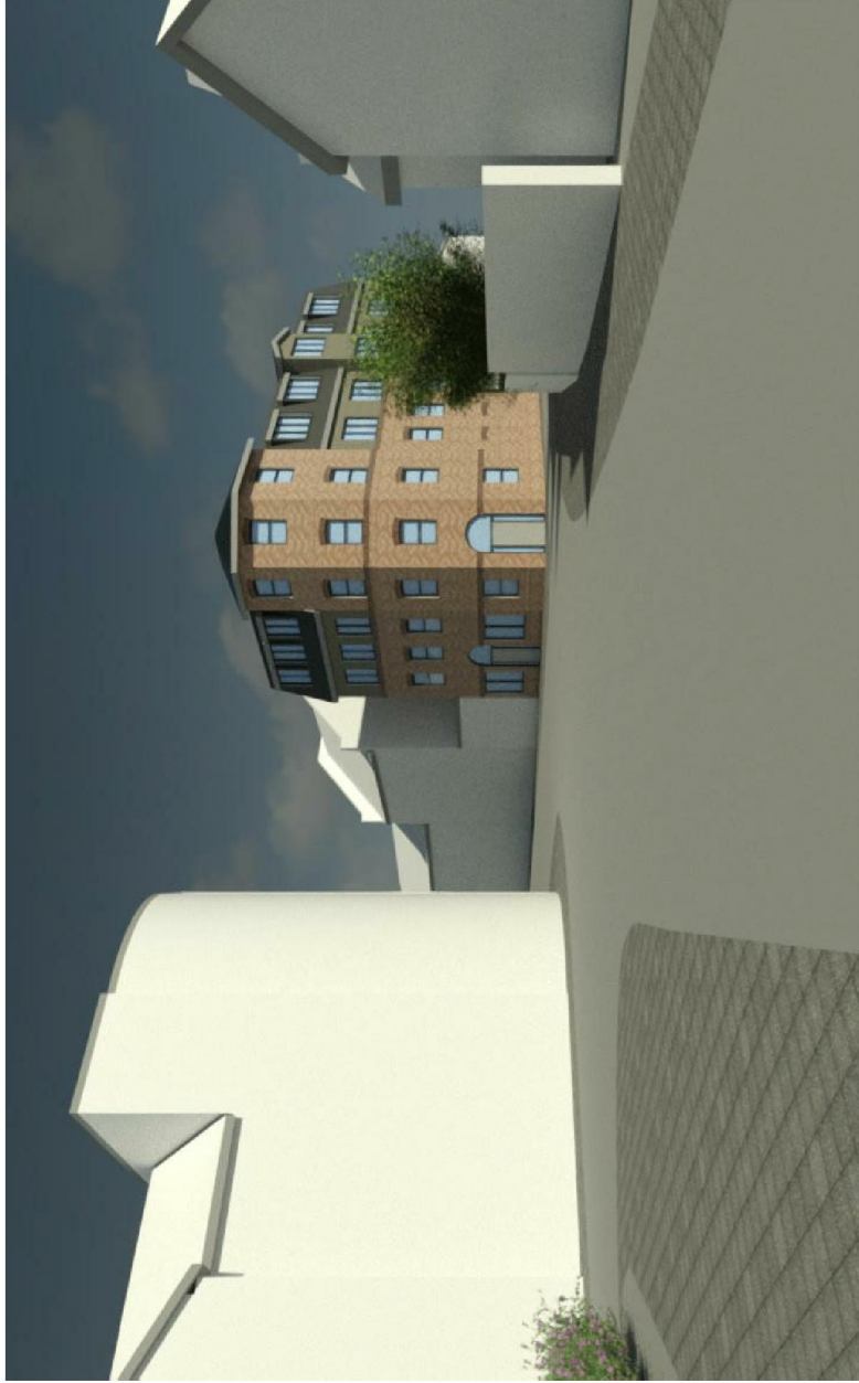
Street View 1