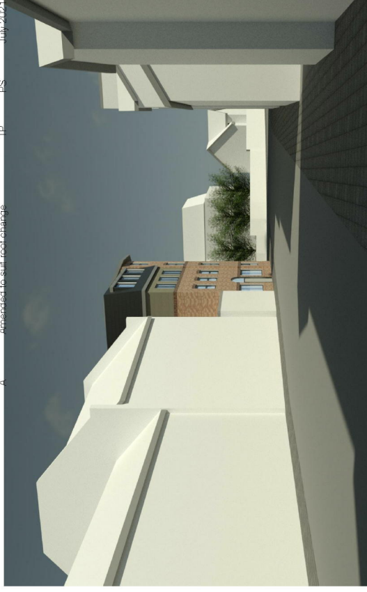
Street View 3

REVISION / CHKD DRAWN DATE A / Amended to suit roof change TP PS July 2021