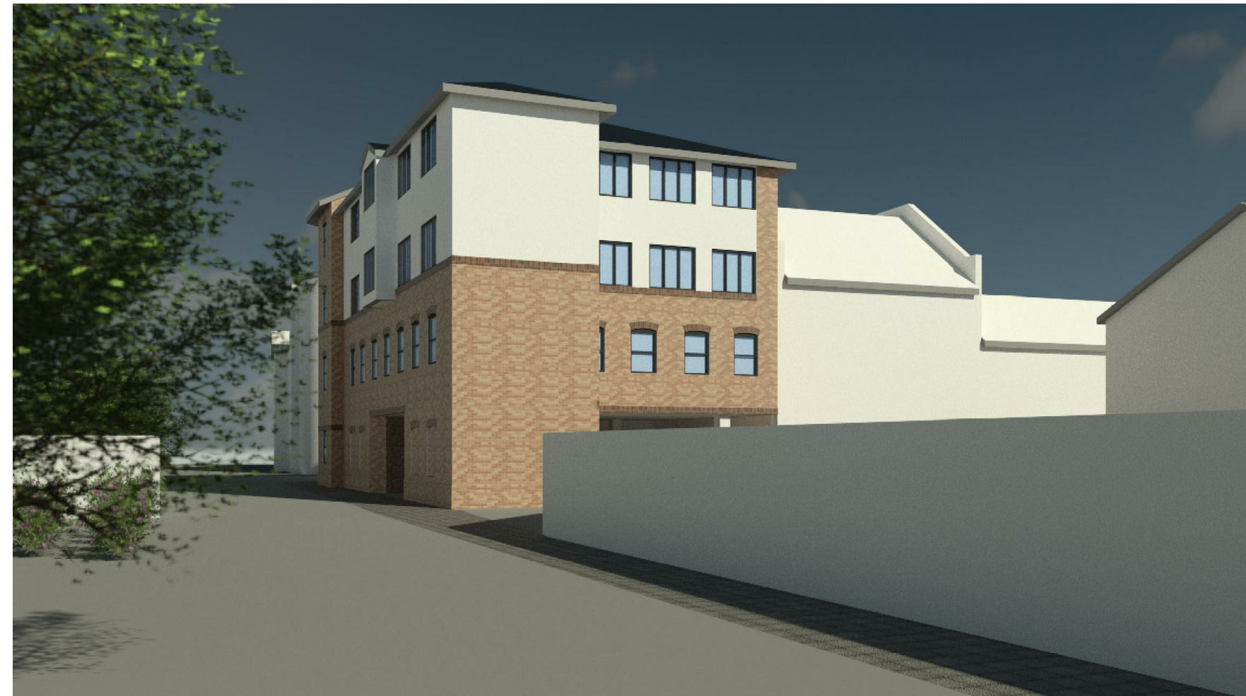
Street View 2