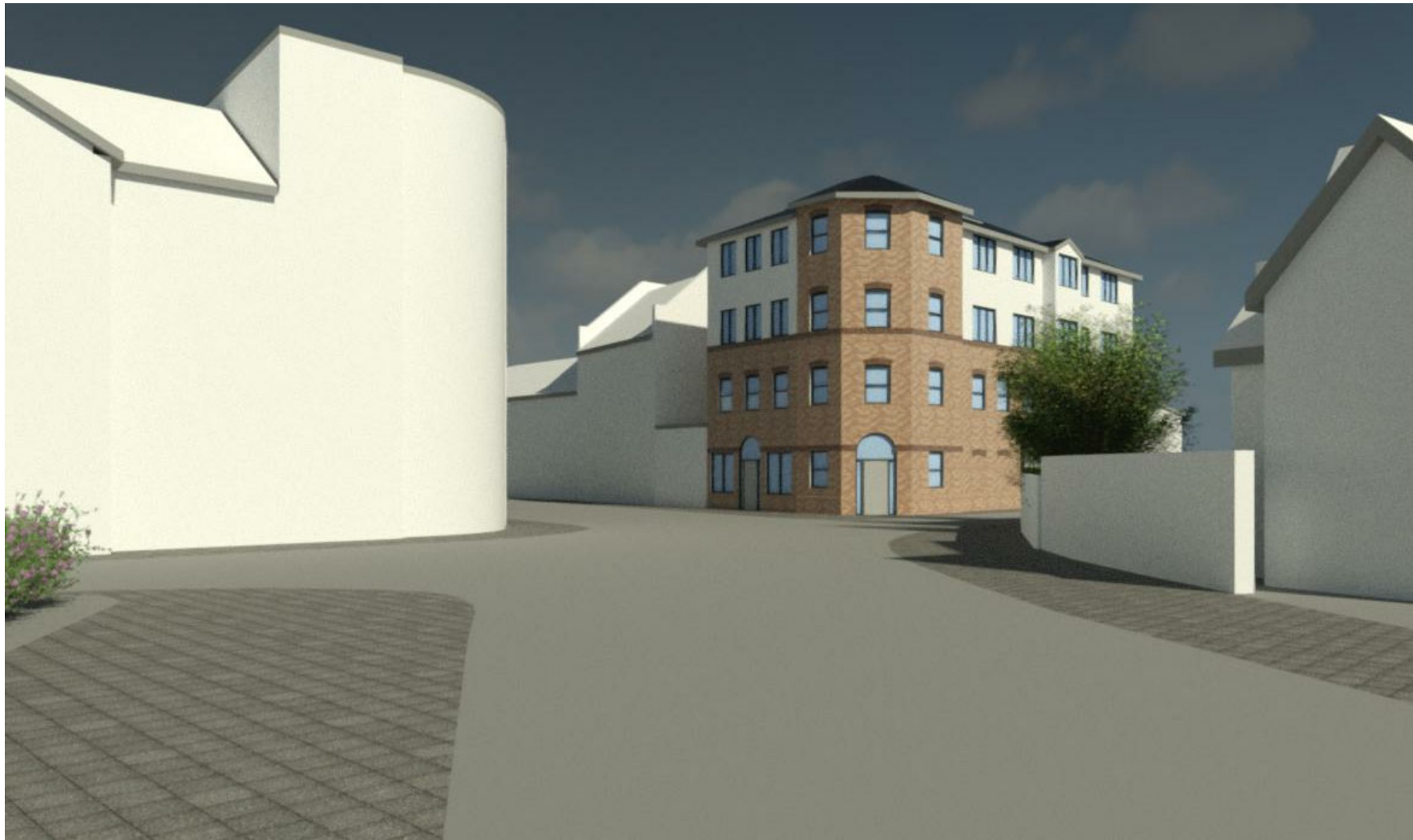
Street View 1