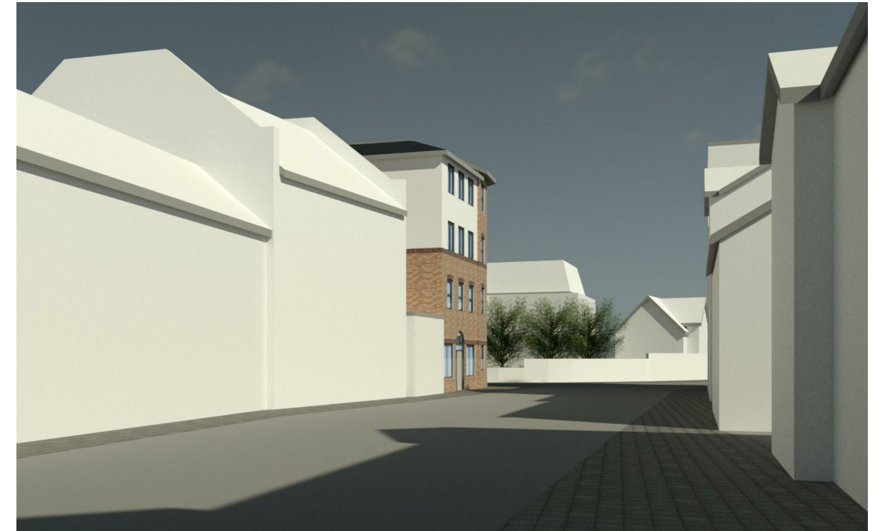
Street View 3