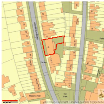
SITE LOCATION PLAN Scale 1:1250.