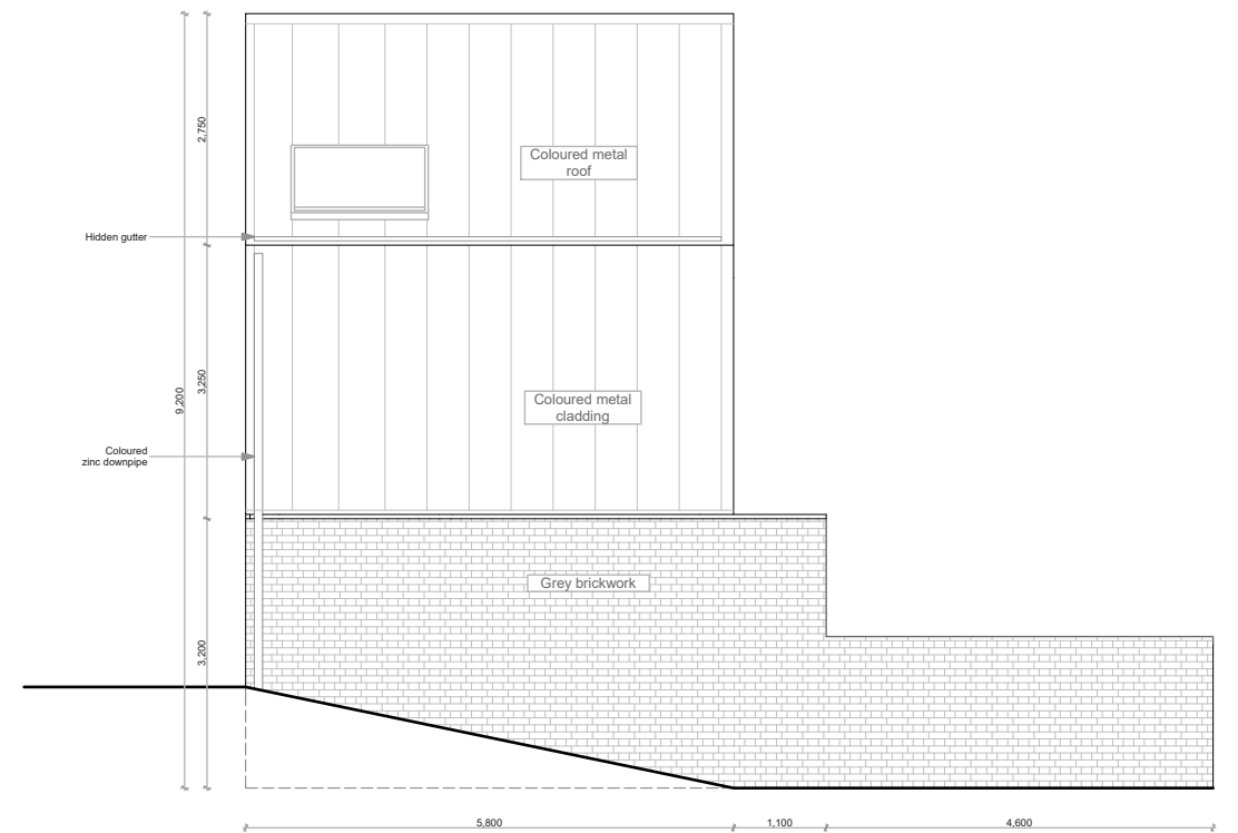
West Elevation (Unit 1)