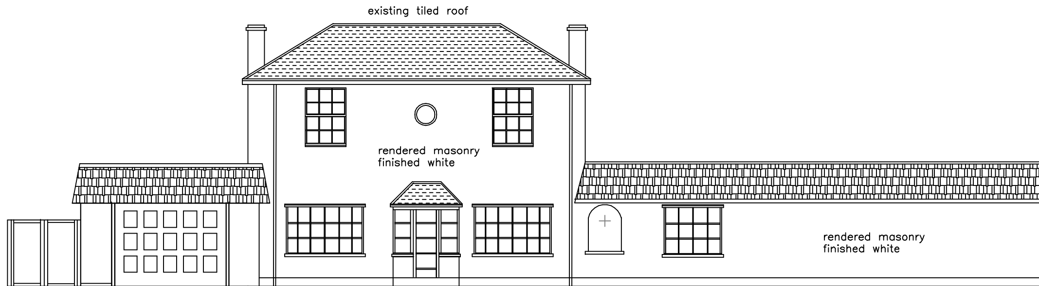
EXISTING FRONT ELEVATION SOUTH