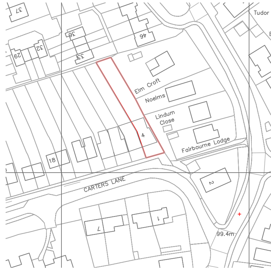
SITE LOCATION PLAN SCALE 1 : 1 250 with SITE OUTLINED IN RED