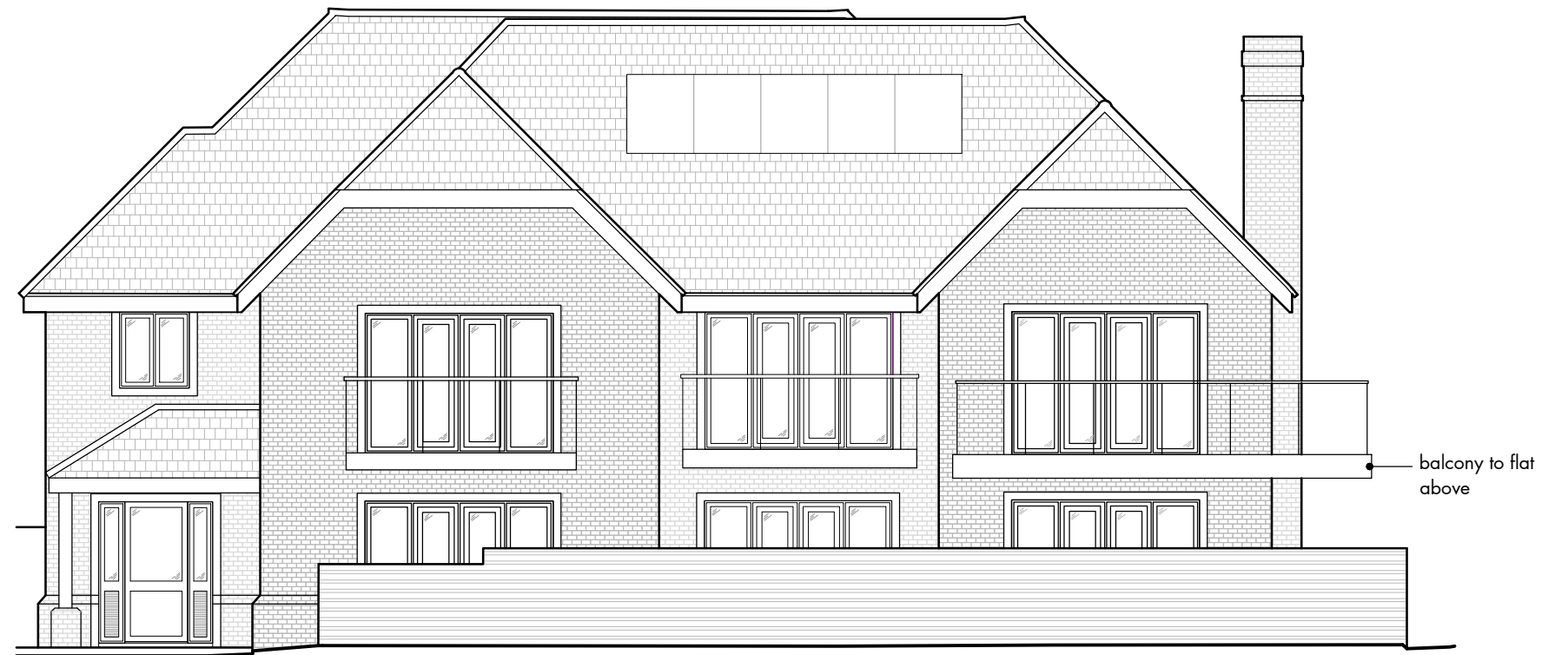
Existing Contextual Elevation