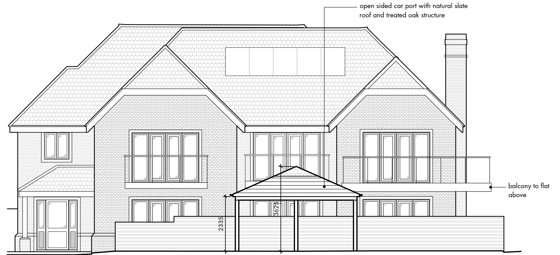
Proposed Contextual Elevation