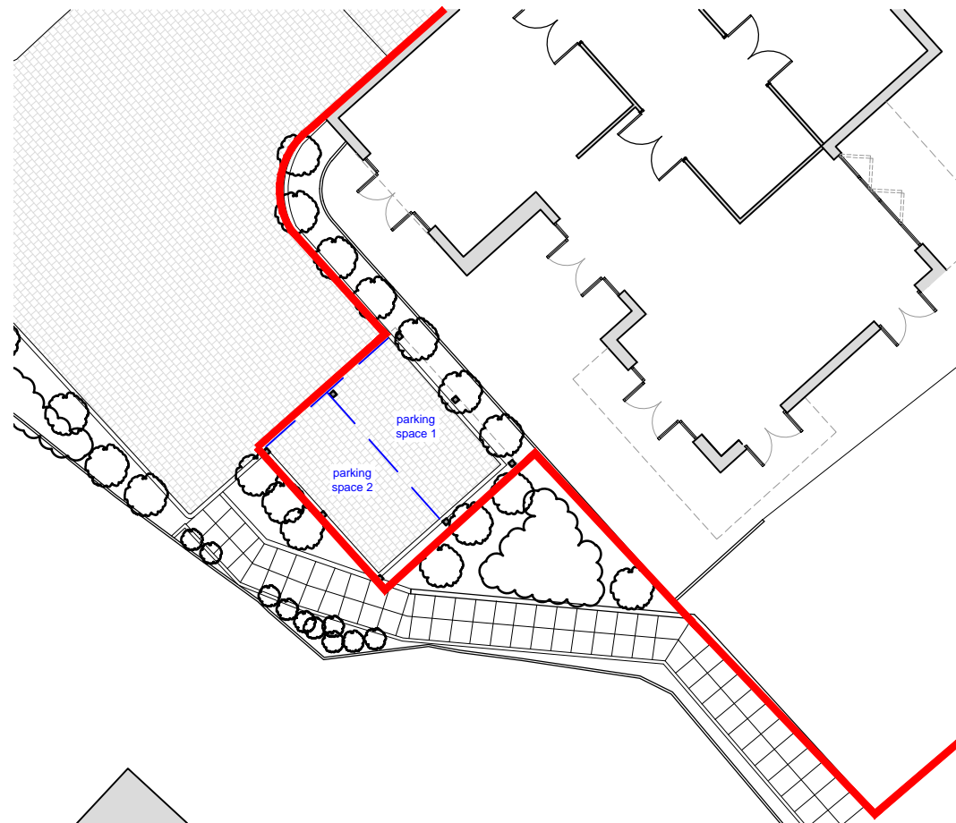
Proposed Site Plan Scale 1:200