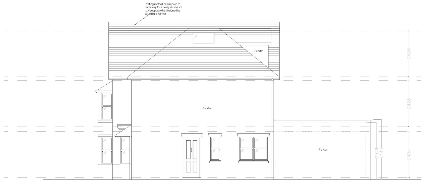
PROPOSED FRONT ELEVATION SCALE 1:100 @ A3