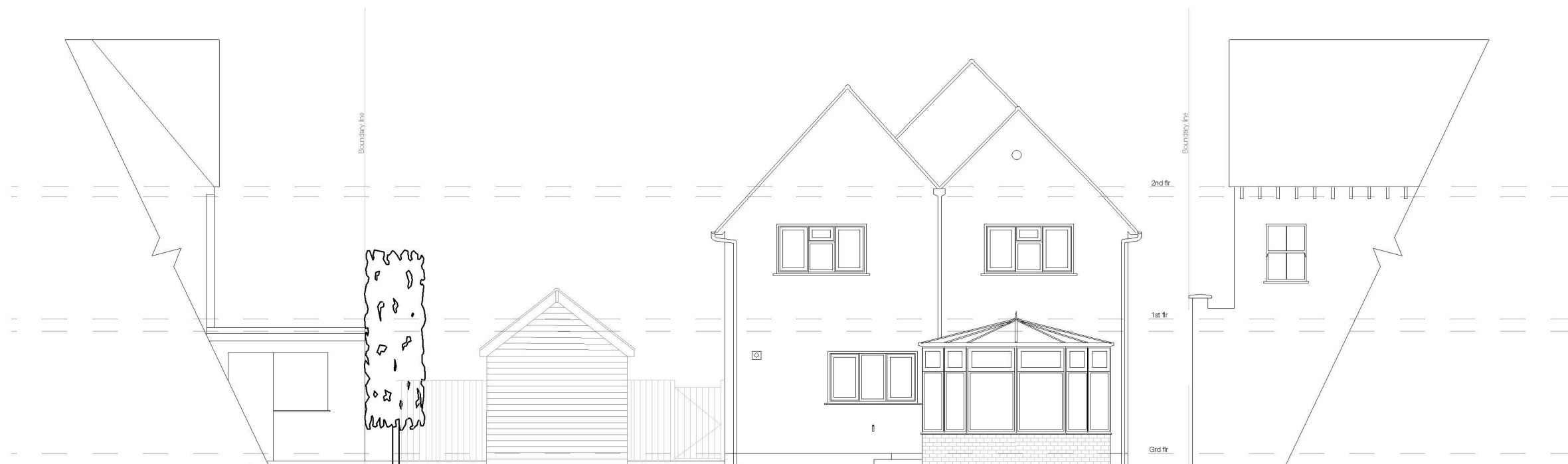
EXISTING REAR ELEVATION SCALE 1:100 @ A3