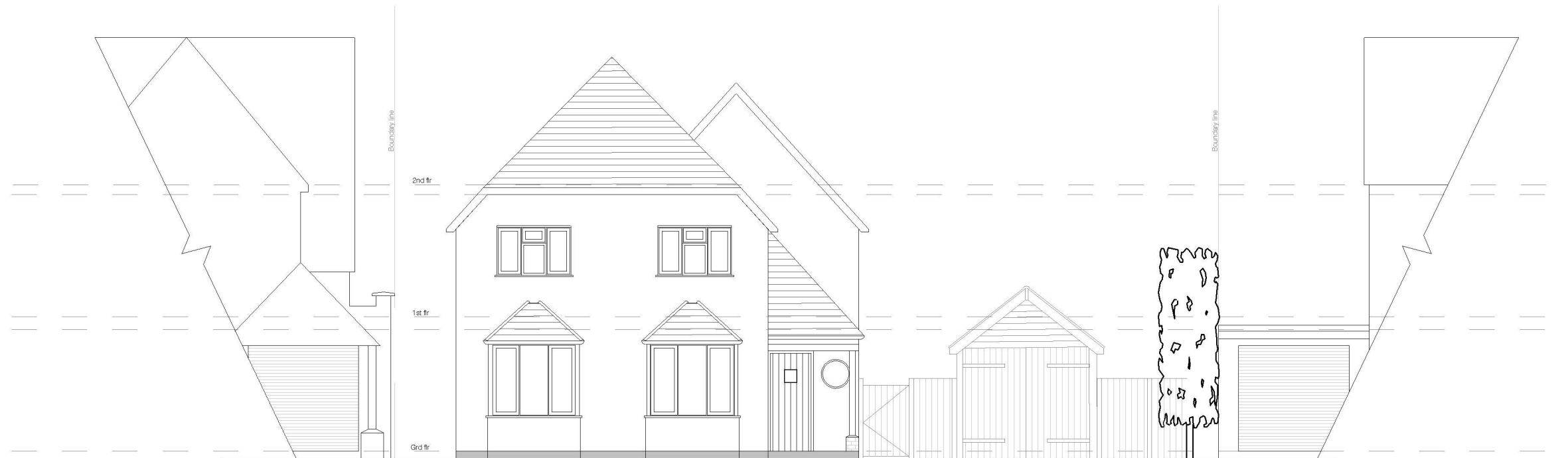
EXISTING FRONT ELEVATION SCALE 1:100 @ A3