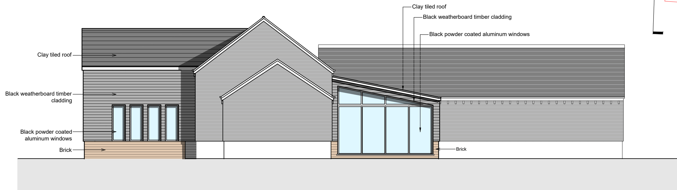
Proposed west elevation