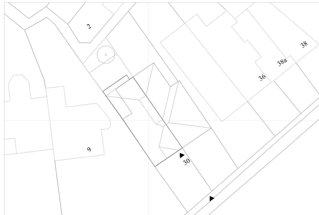
SITE PLAN 1/250

Produced on 17 June 2019 from the Ordnance Survey National Geographic Database and incorporating surveyed revision available at this date. This map shows the area bounded by 542333,196751 542333,196851 542433,196851 542433,196751 Reproduction in whole or part is prohibited without the prior permission of Ordnance Survey. Crown copyright 2019. Supplied by copla ltd trading as UKPlanningMaps.com a licensed Ordnance Survey partner (100054135). Data licenced for 1 year, expiring 17 June 2020. Unique plan reference: v1c/359052/487722