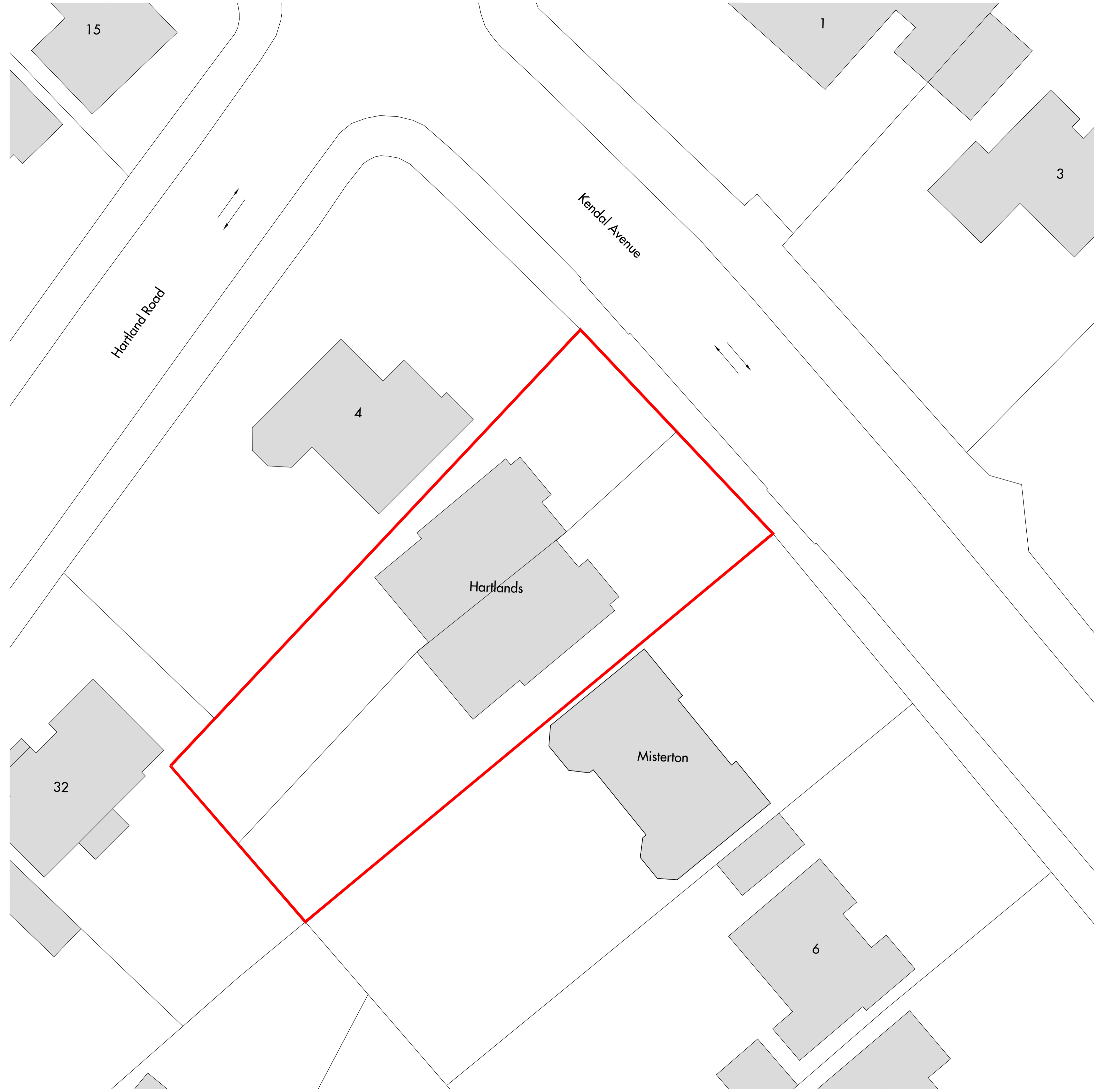
Proposed Site Plan Scale 1:200

Site Boundary: - Site boundary assumed and indicated as shown based on interpretation of Land Registry site plan supplied by Client and topographical survey. - Should exact clarification of boundary be required then a third party boundary professional must be appointed - Main contractor to ensure all construction, including both superstructure and substructure stays within site boundary at all times