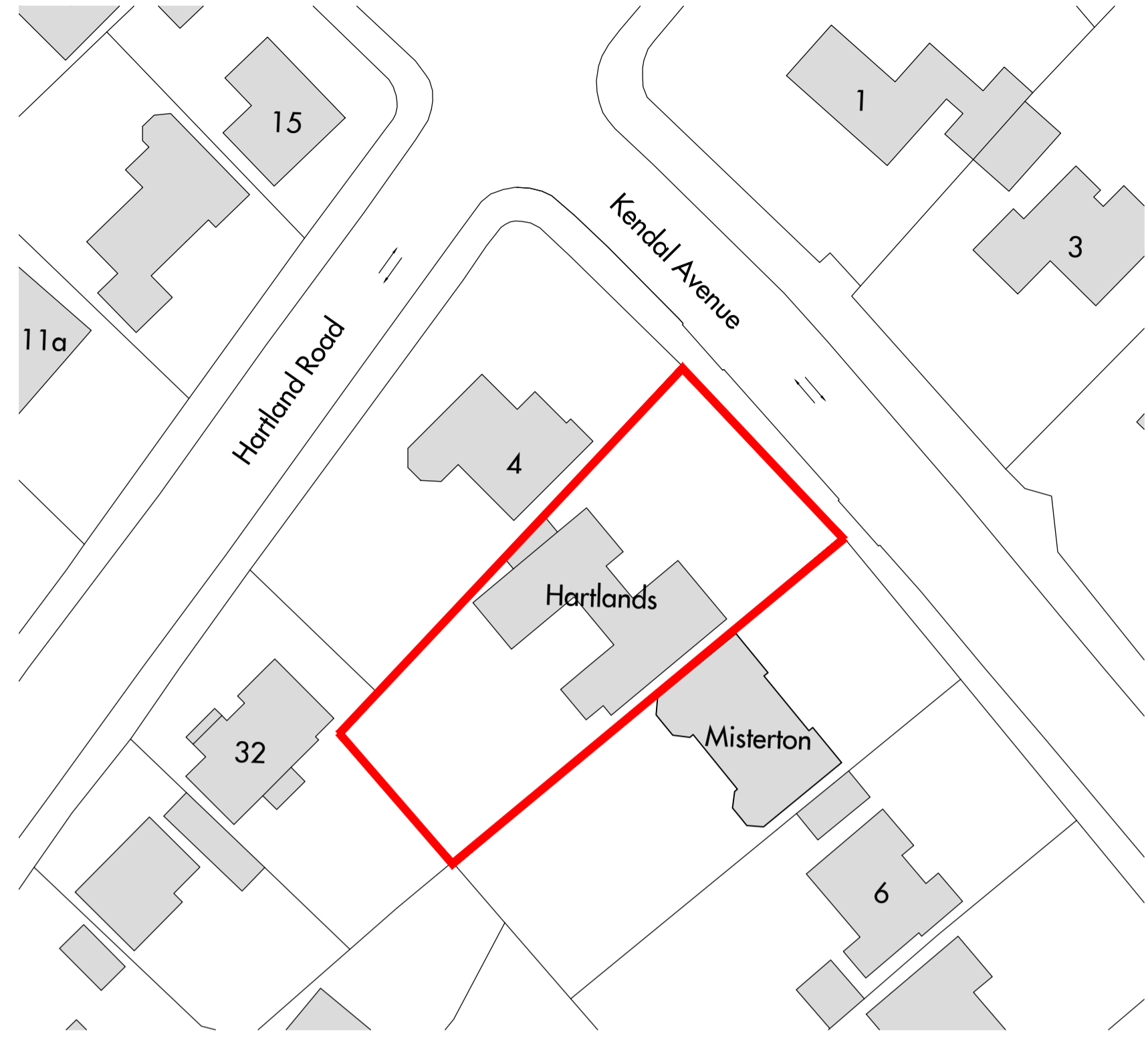
Existing Block Plan Scale 1:500