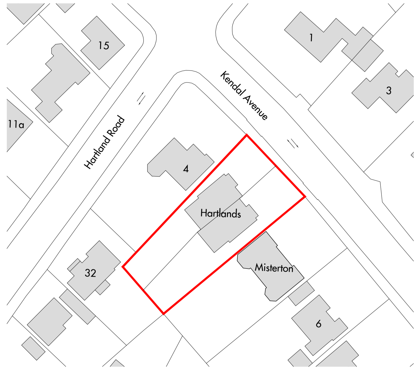
Proposed Block Plan Scale 1:500