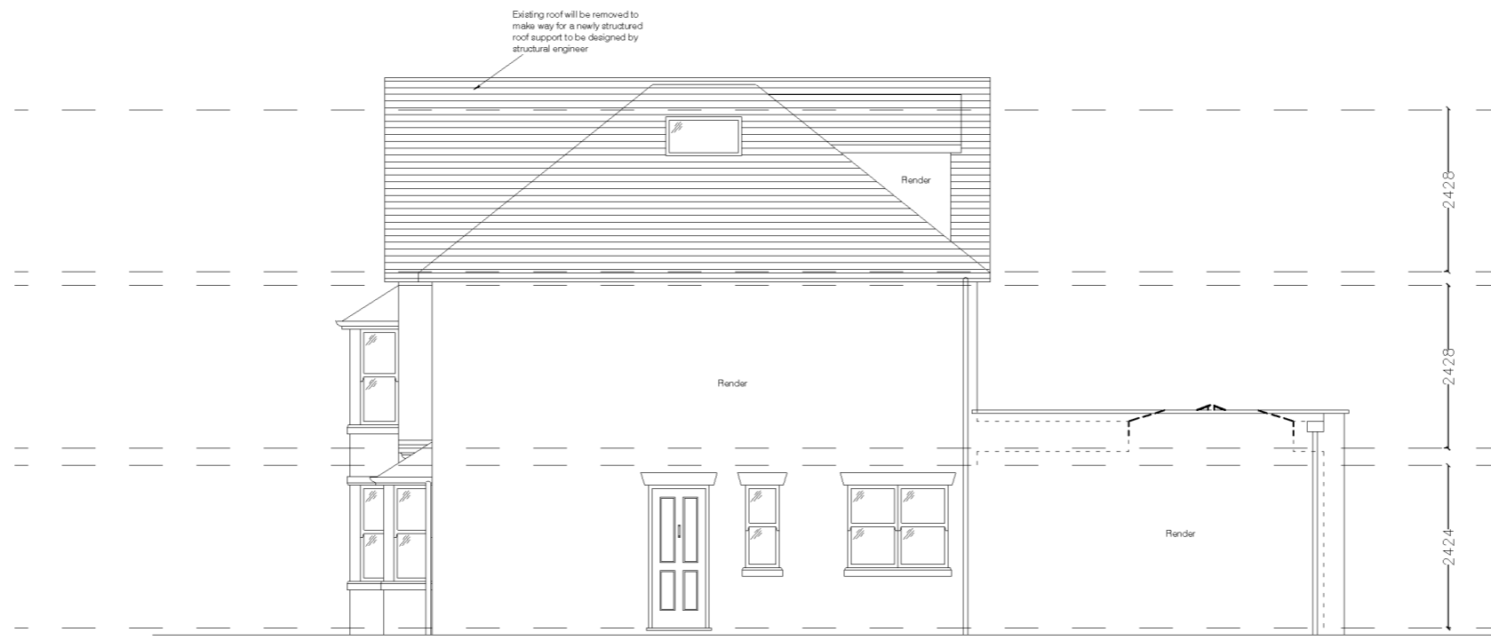
PROPOSED FRONT ELEVATION SCALE 1:100 @ A3