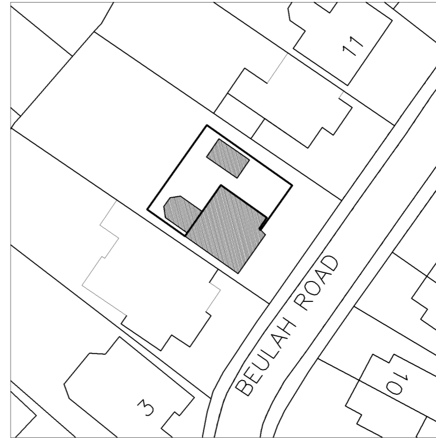
BLOCK PLAN SCALE 1 : 500 with NEW HOUSE OUTLINED IN BLUE and EXISTING HOUSE SHADED IN GREY.