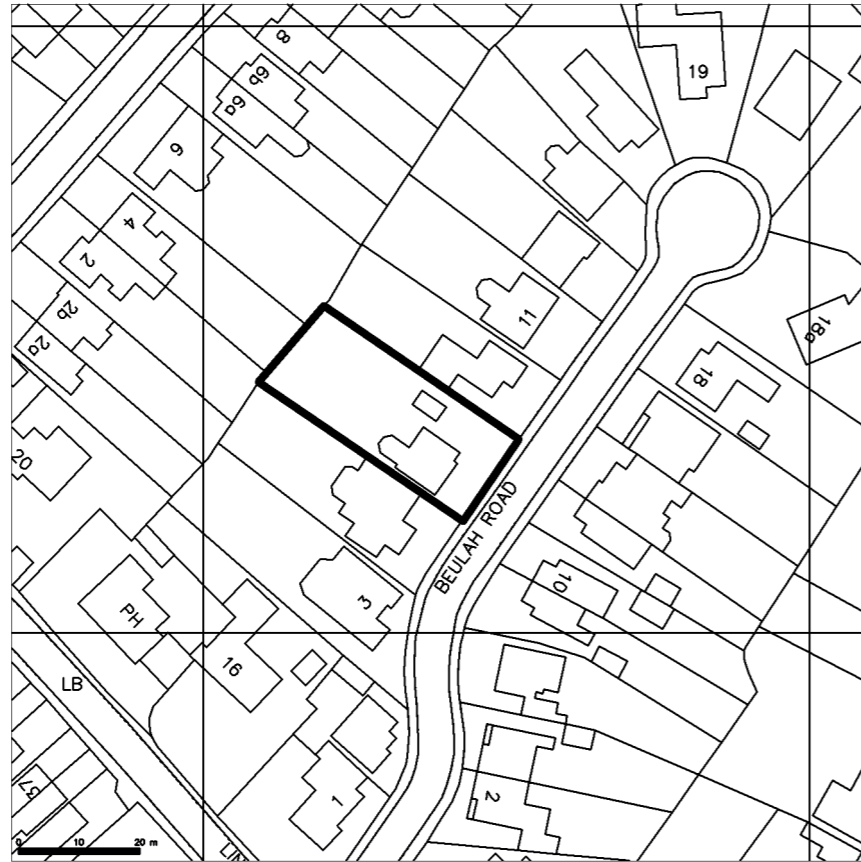
SITE LOCATION PLAN SCALE 1 : 1 250 with SITE OUTLINED IN RED