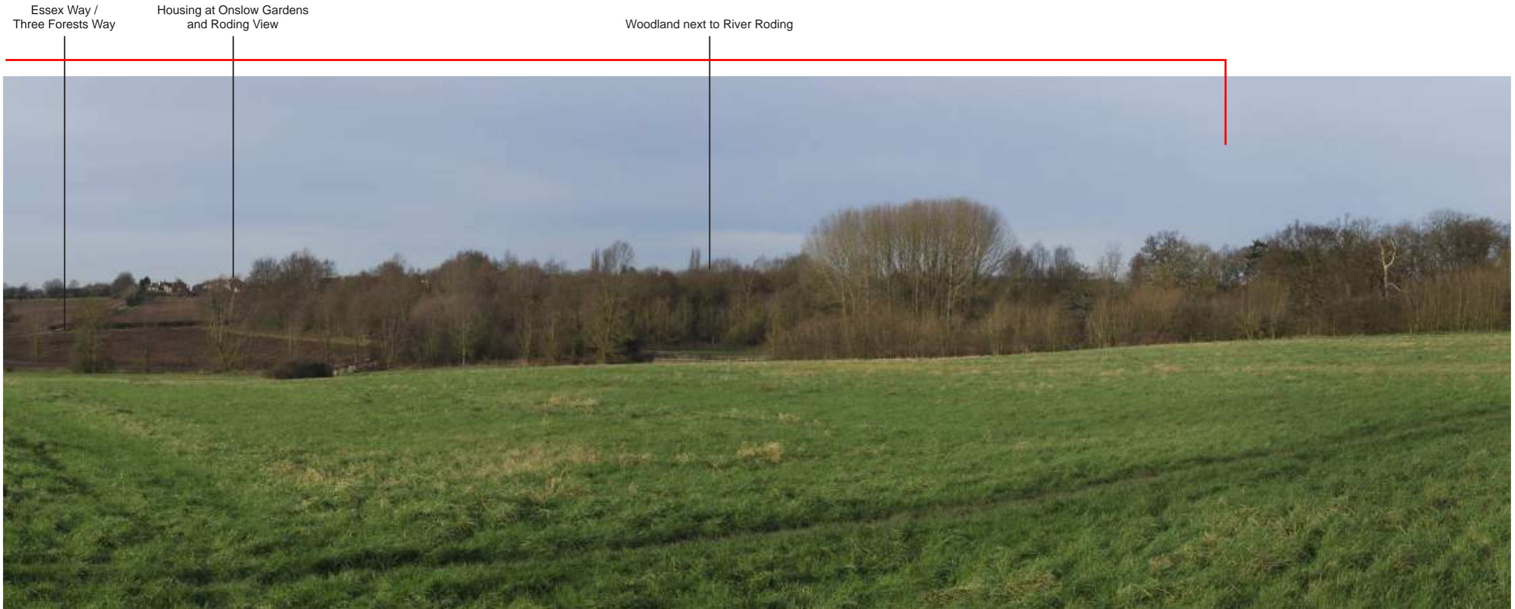
Representative Viewpoint 1 (Right) - View from western edge of High Ongar looking west

X:\JOBS\4823_Chipping_Ongar\6docs\Photopanels\4823_PP_001.indd