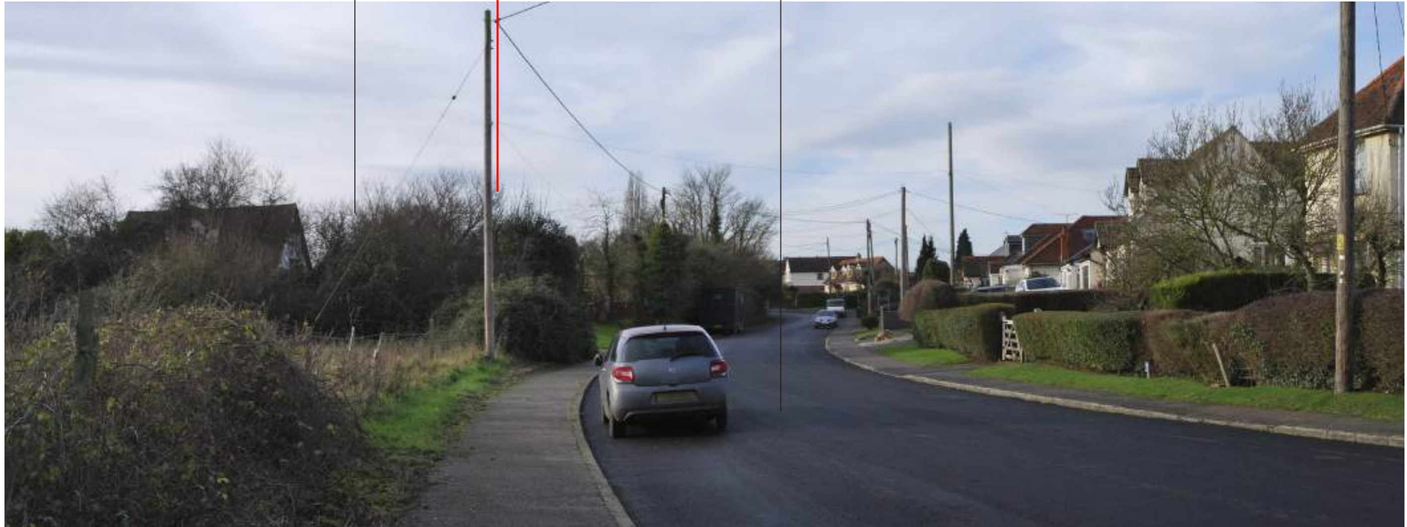
Viewpoint 3 (Right) - View from High Ongar Road looking south east

ISSUED BY Peterborough t: 01733 310471 DATE Dec 2016 DRAWN ECo SCALE@A3 NTS CHECKED RK STATUS Final APPROVED RK