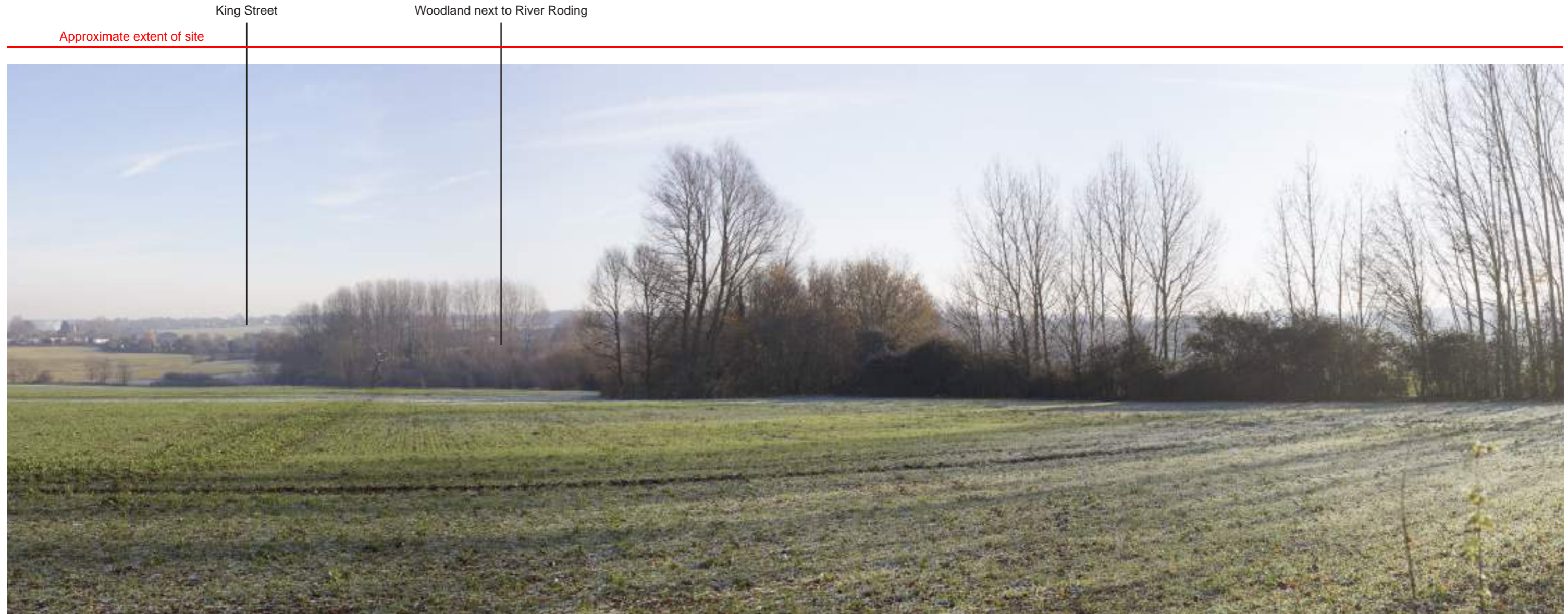
Representative Viewpoint 02 (Right) - Three Forests Way Long Distance Footpath within Site looking east

X:\JOBS\4823_Chipping_Ongar\6docs\VA\Photopanel\4823_PP_103