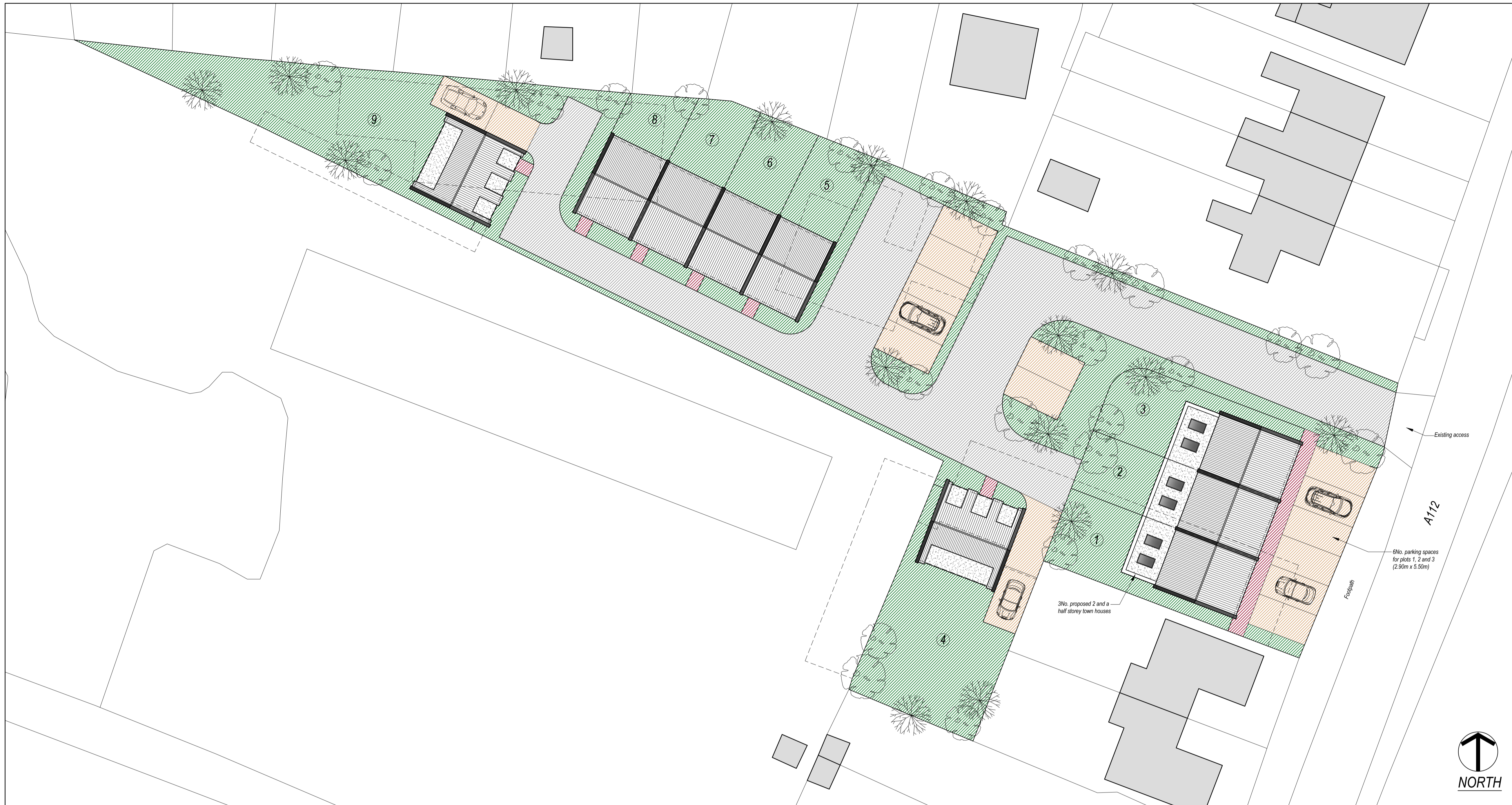
Proposed Site Plan Scale: 1:200