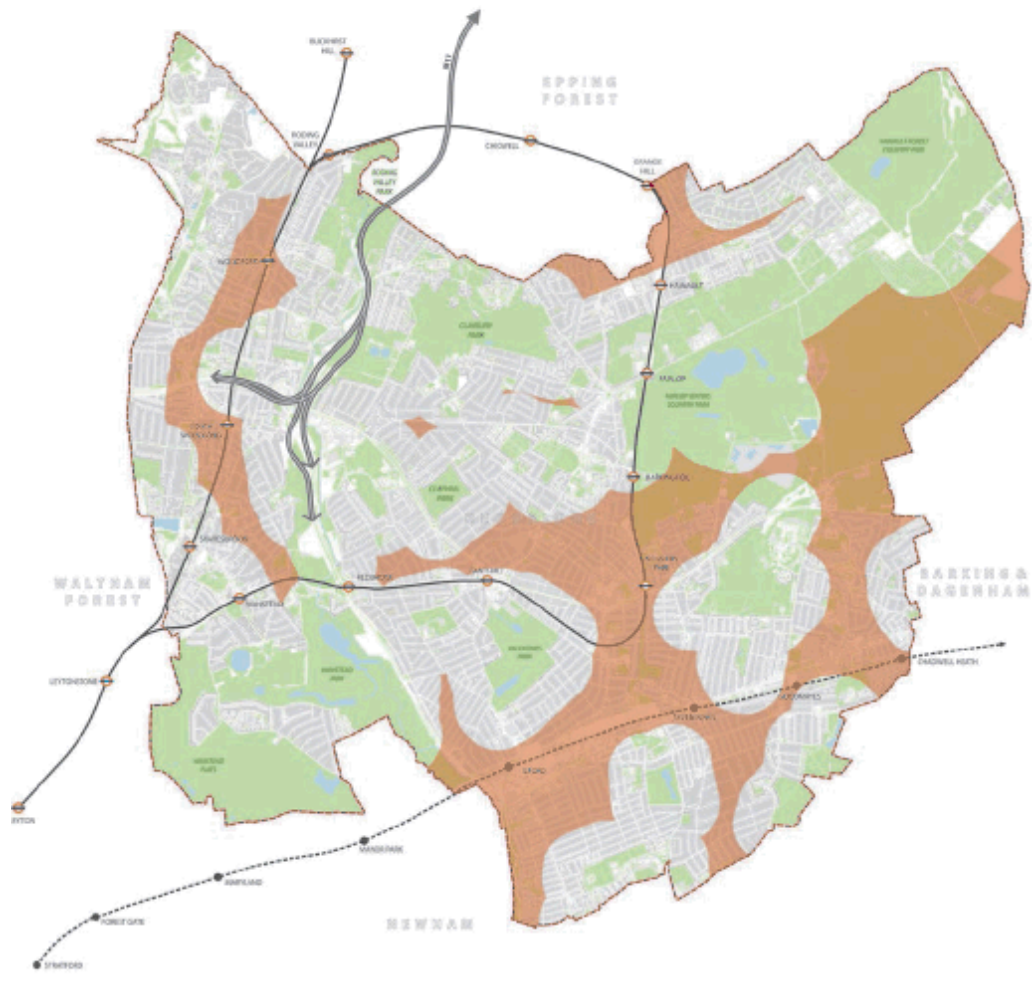
FIGURE 24: Areas of Open Space Deficiency

I look forward to your considered response.