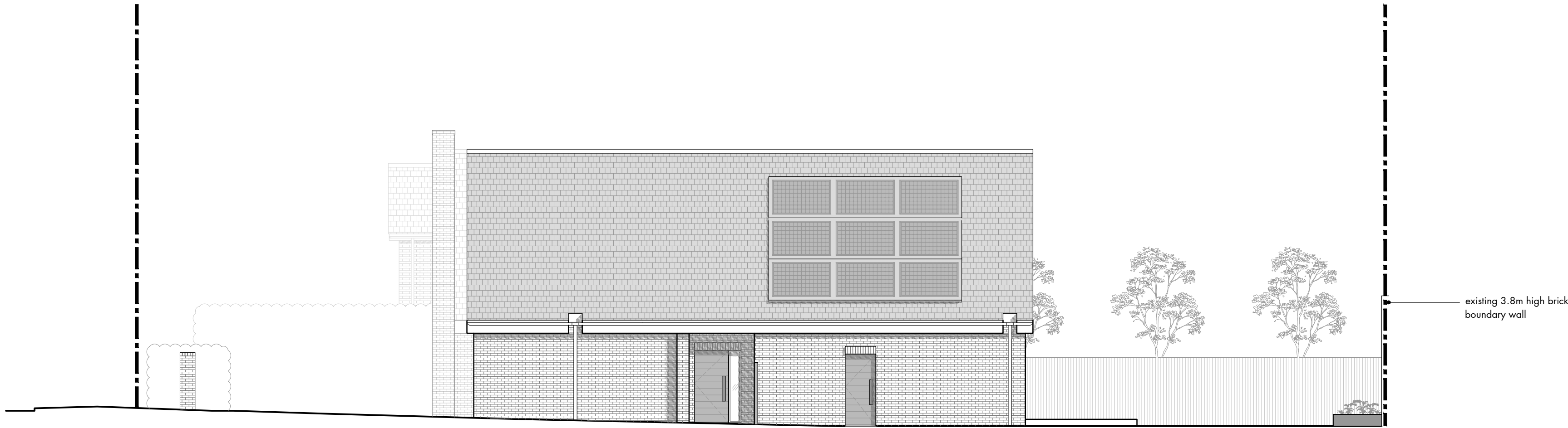
Proposed West Elevation