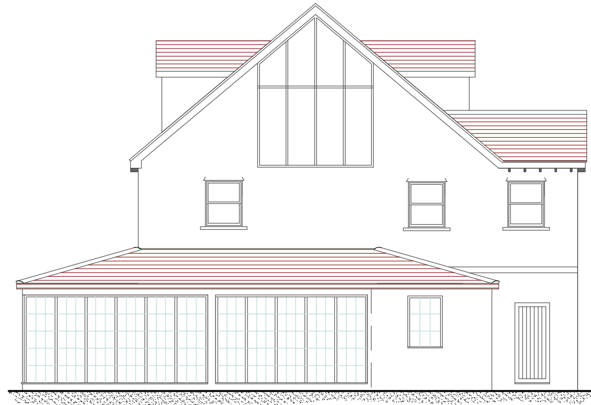
PROPOSED LH SIDE ELEVATION