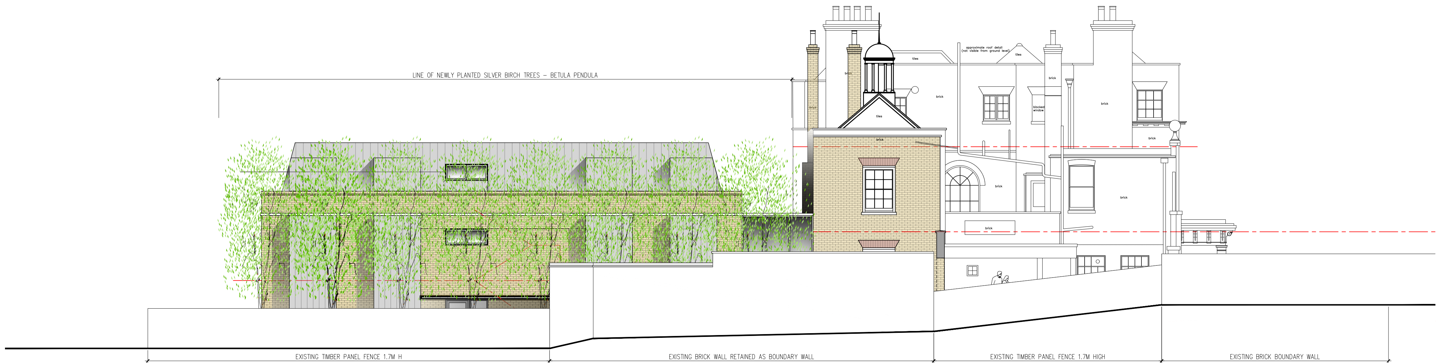
NORTH EAST ELEVATION SHOWING BOUNDARY WALL AND PROPOSED TREE SCREENING - VIEW FROM NEIGHBOURS