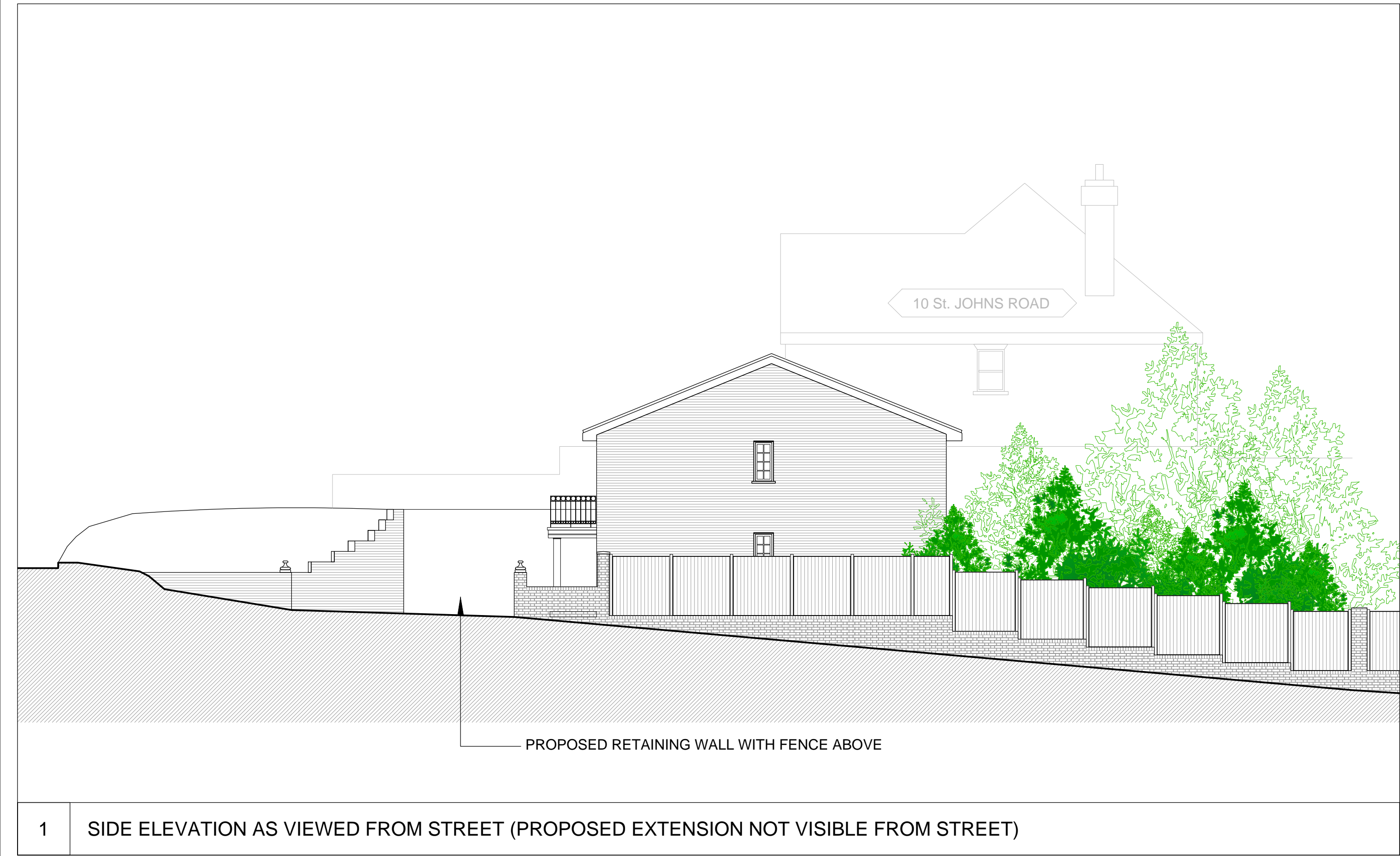
1 SIDE ELEVATION AS VIEWED FROM STREET (PROPOSED EXTENSION NOT VISIBLE FROM STREET)