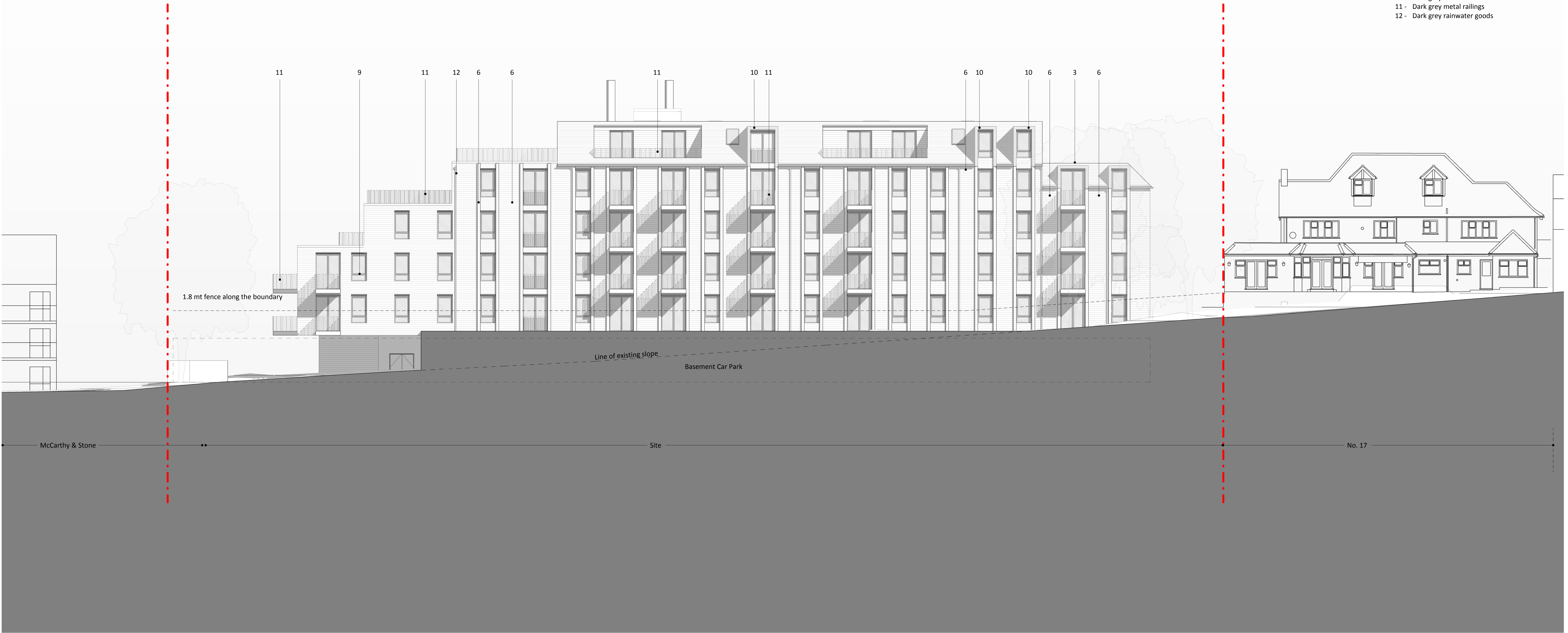
1 Proposed South Elevation 1 : 100