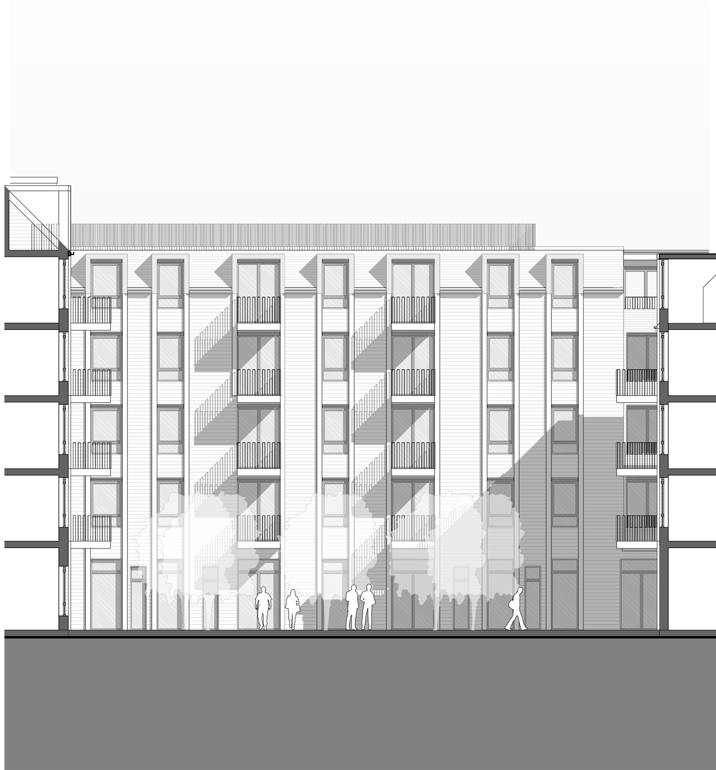
1 North-South section as proposed looking West AA 1 : 100