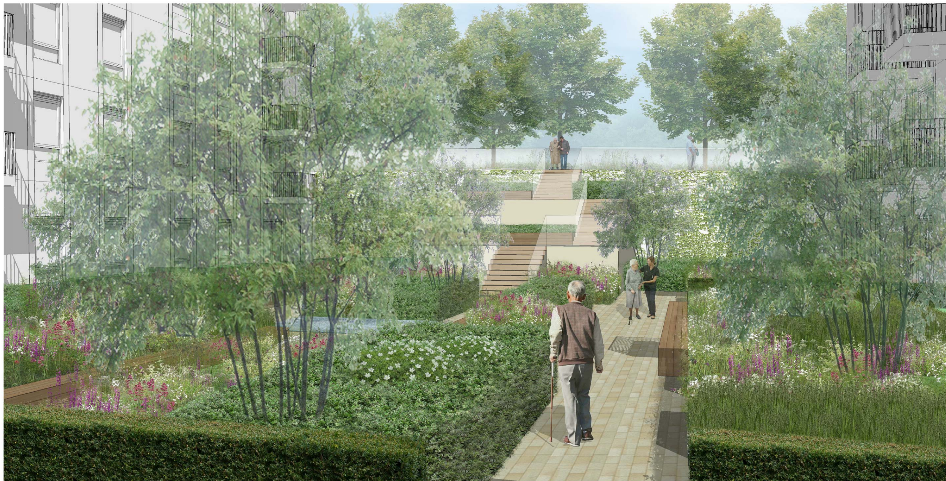
Artist impression of the courtyard - BHSLA