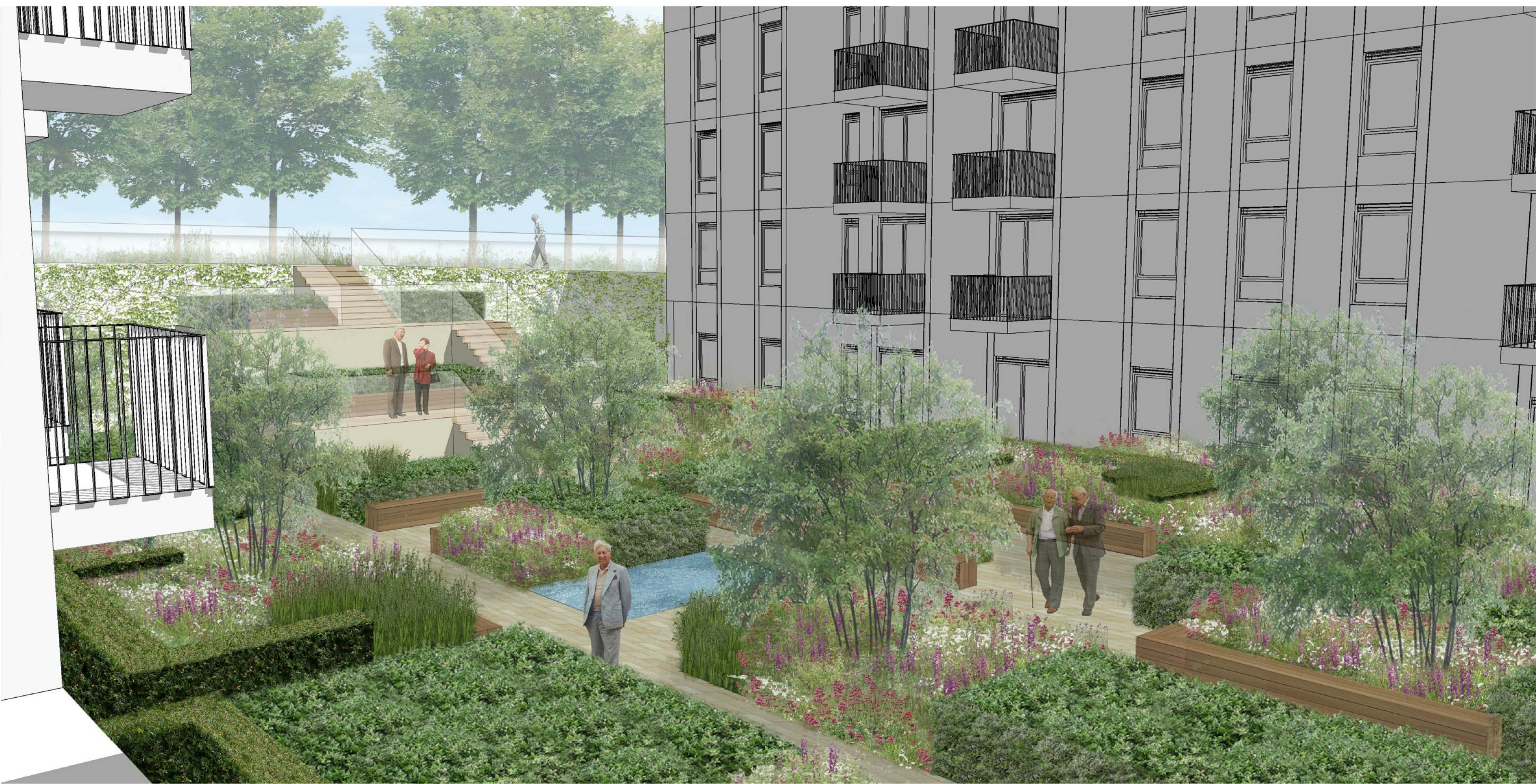
Artist impression of the courtyard - BHSLA