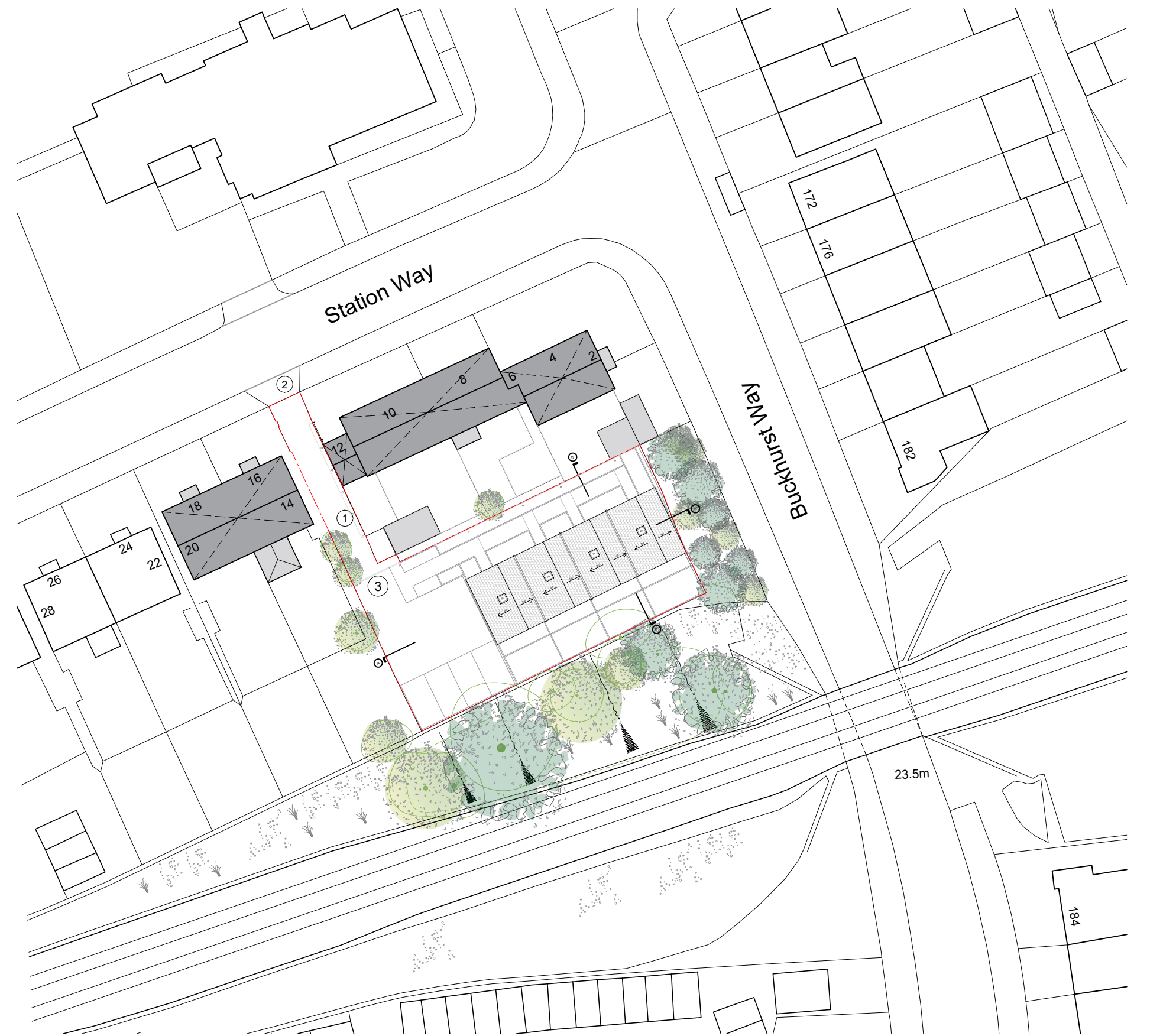
1 Block Plan - Proposed