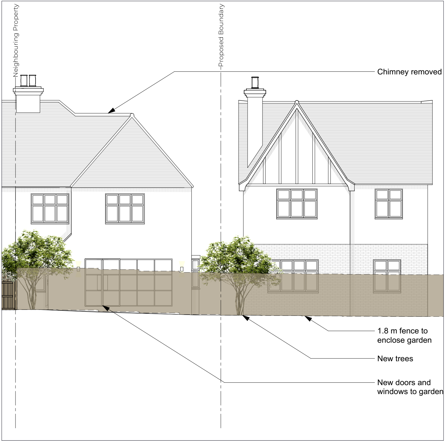
2 Proposed Brooklyn Avenue Elevation Scale: 1:100