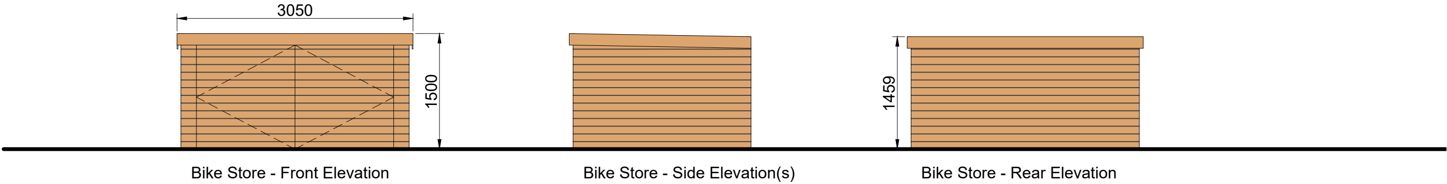
Bike Store - Front Elevation