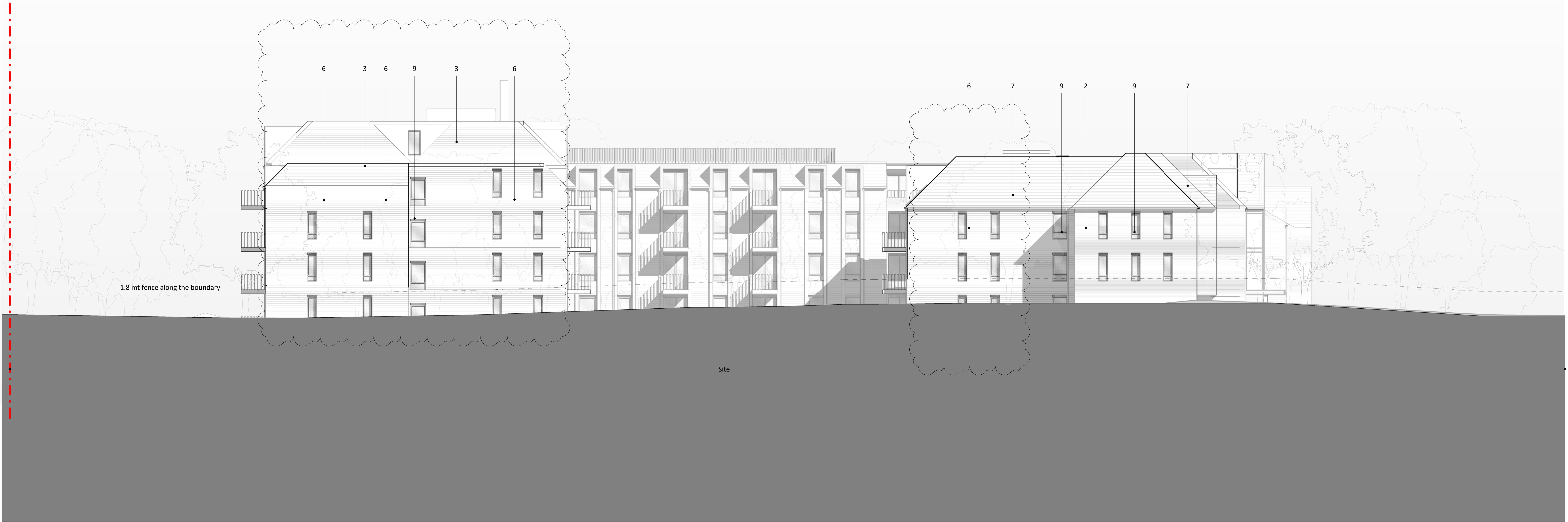
1 Proposed East Elevation 1 : 100