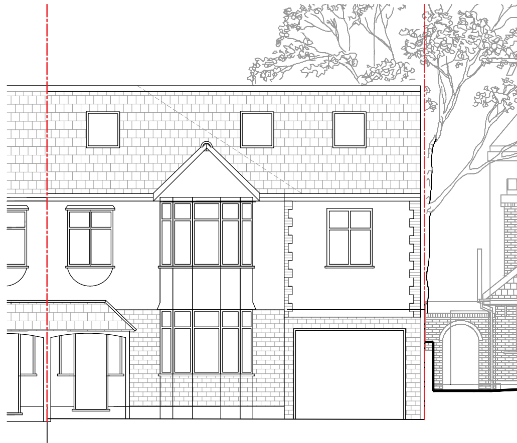
Existing Front Elevations Scale 1:100

Granted Permission EPF/0339/21 - 22/04/21