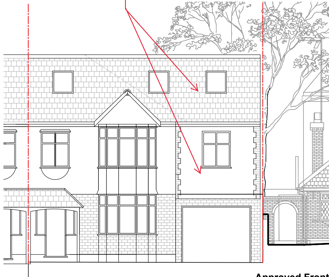
Approved Front Elevations Scale 1:100

Granted Permission EPF/0339/21 - 22/04/21