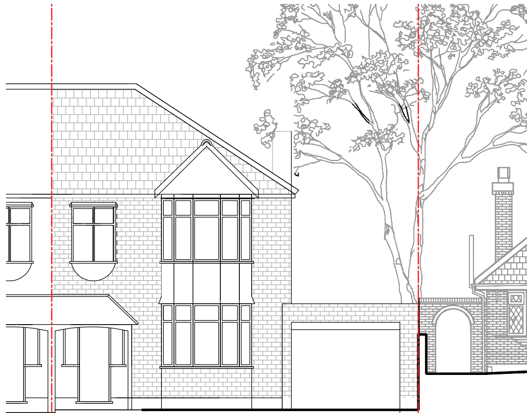
Pre-Existing Front Elevations Scale 1:100