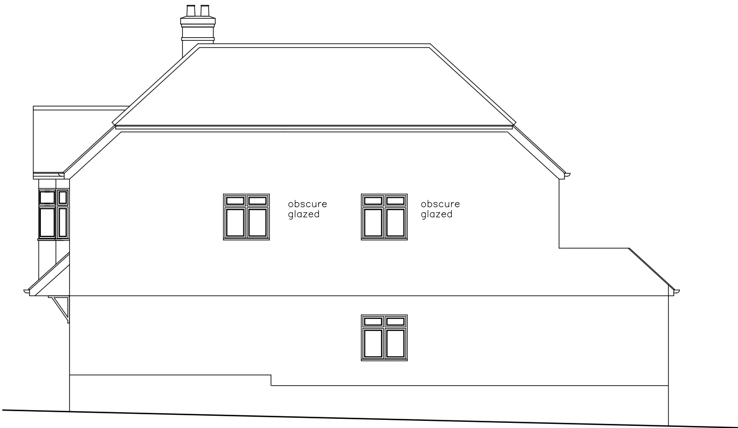
SIDE ELEVATION (NW)