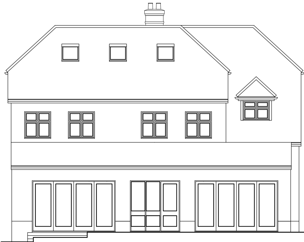
REAR ELEVATION (SW)