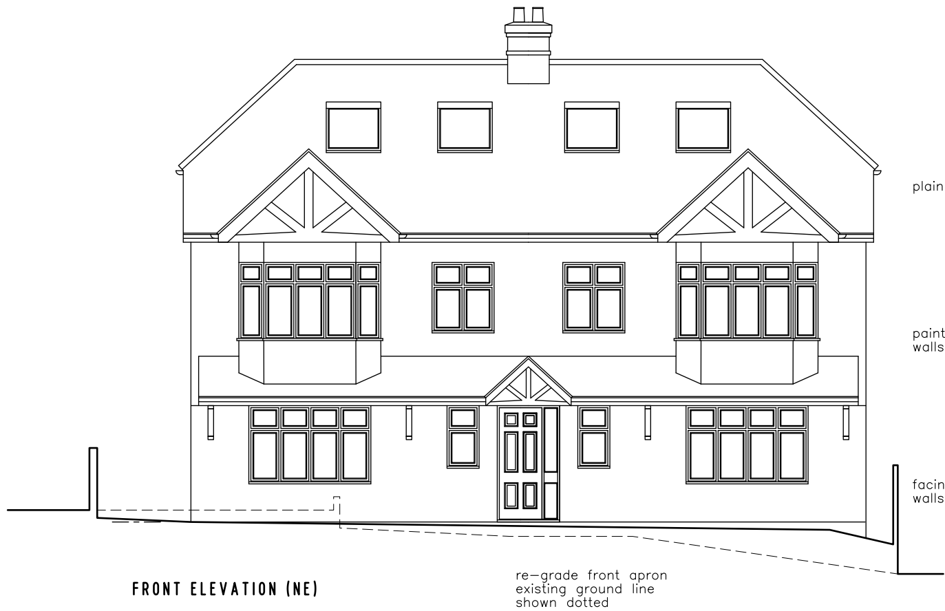
FRONT ELEVATION (NE)