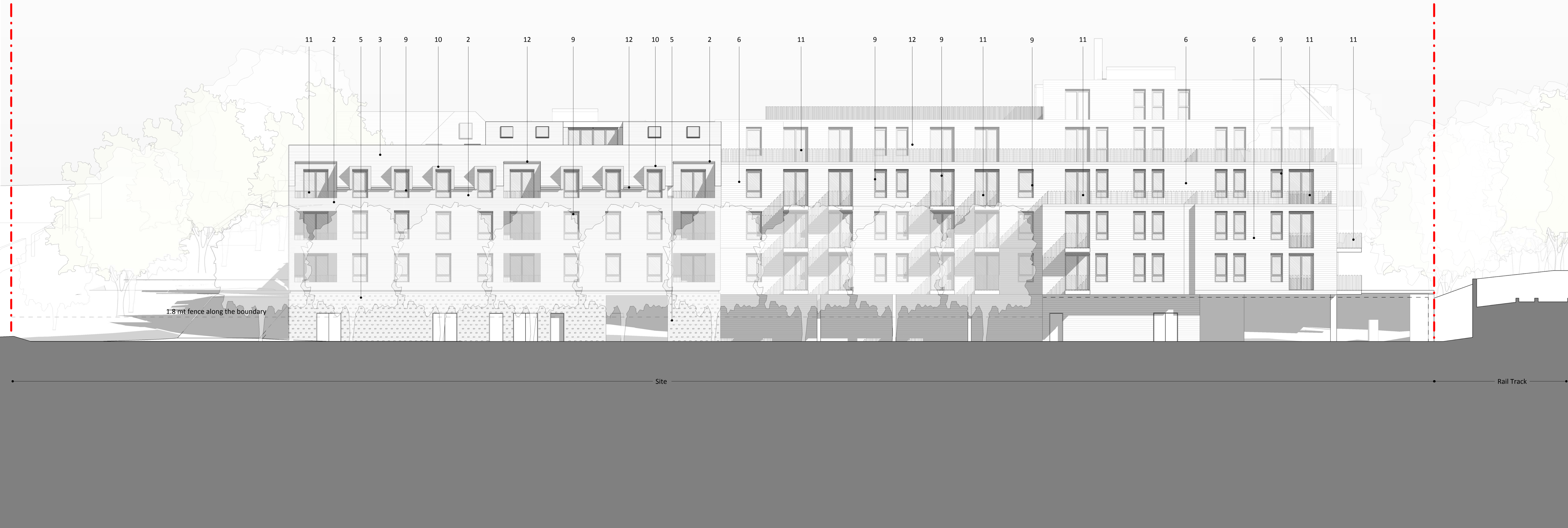
1 Proposed West Elevation 1 : 100