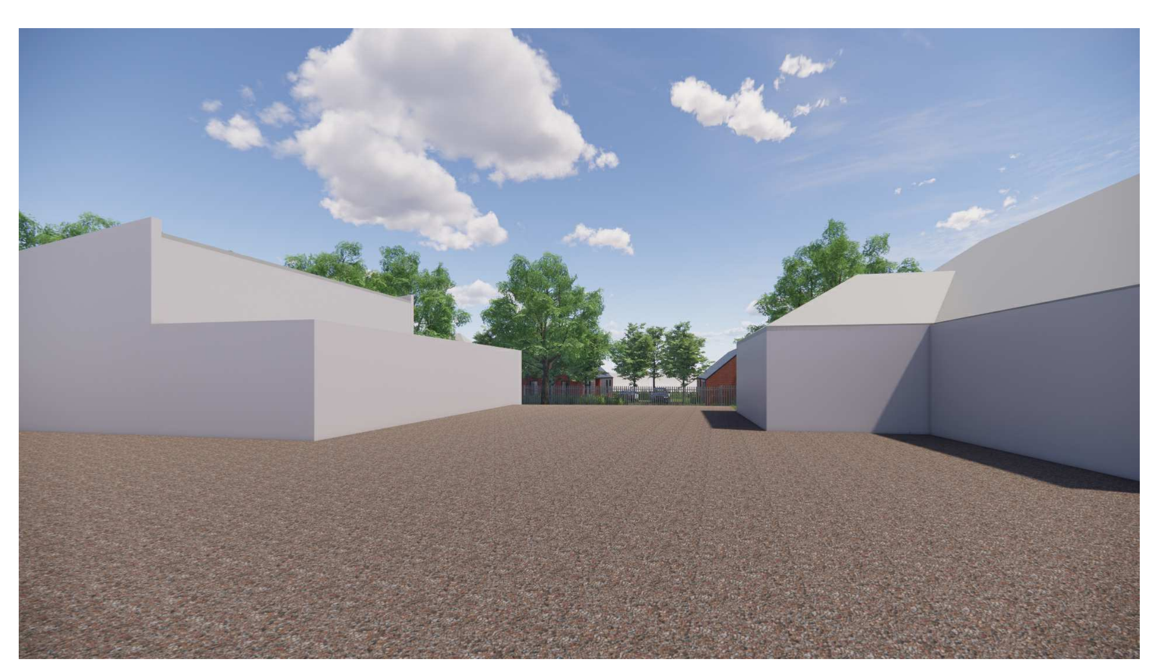
4. View through Telephone Exchange