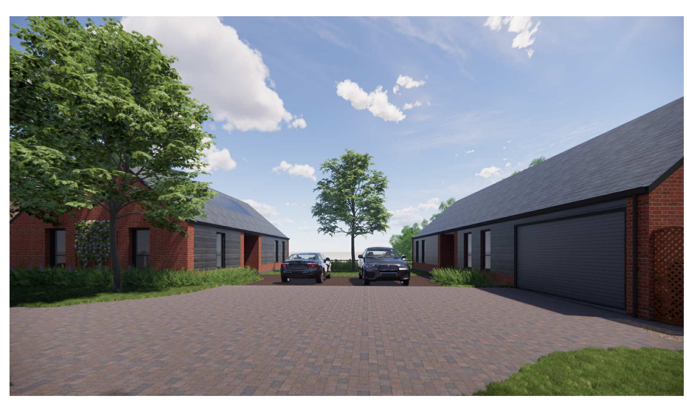
2. Courtyard View