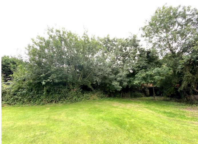
Showing T1, T2 & T3