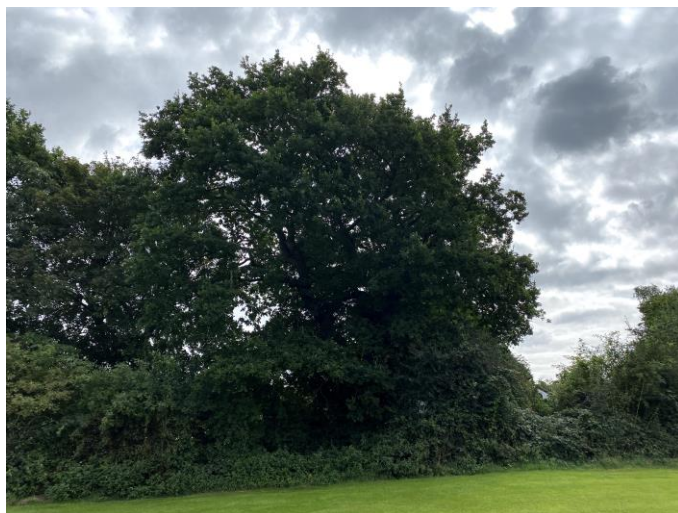
Showing T4 & G3