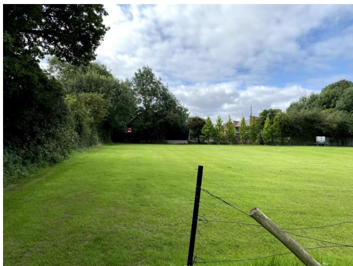
Showing G1 – G3