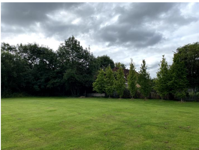
Showing G1 & G2