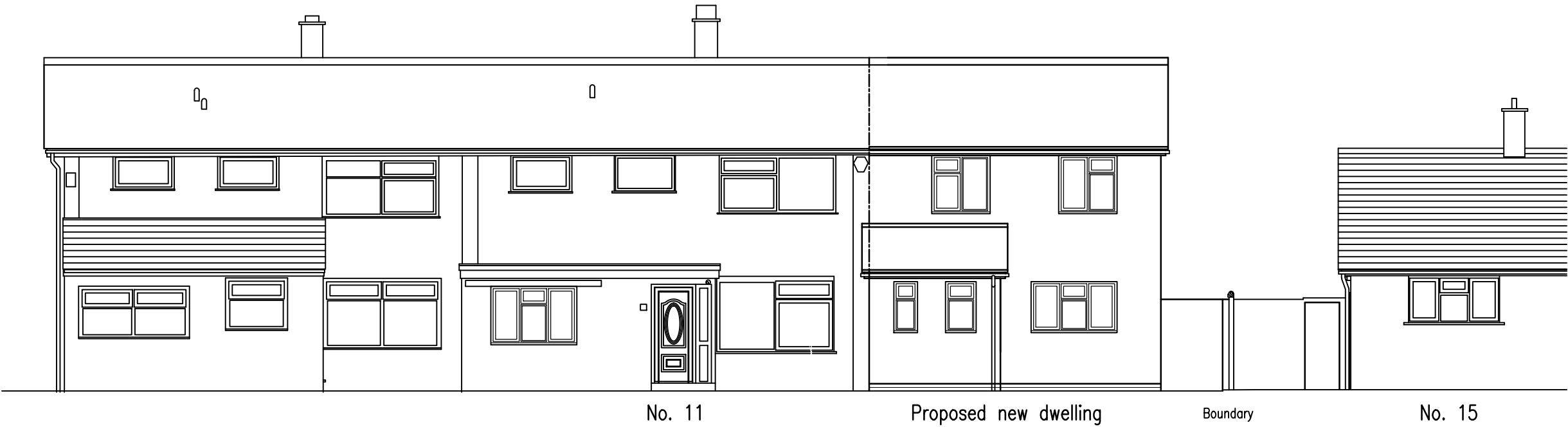
Proposed street scene