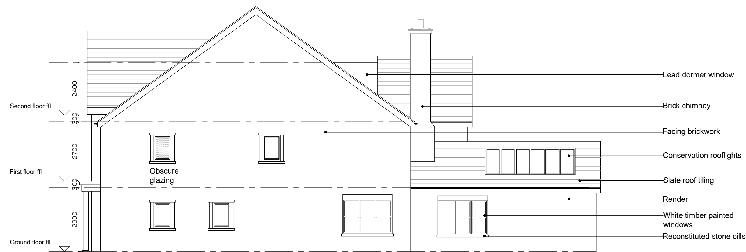
Proposed Side Elevation- 1:100