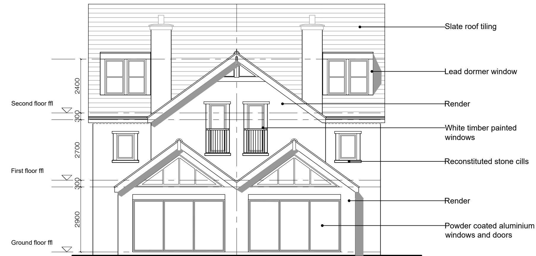
Proposed Rear Elevation- 1:100