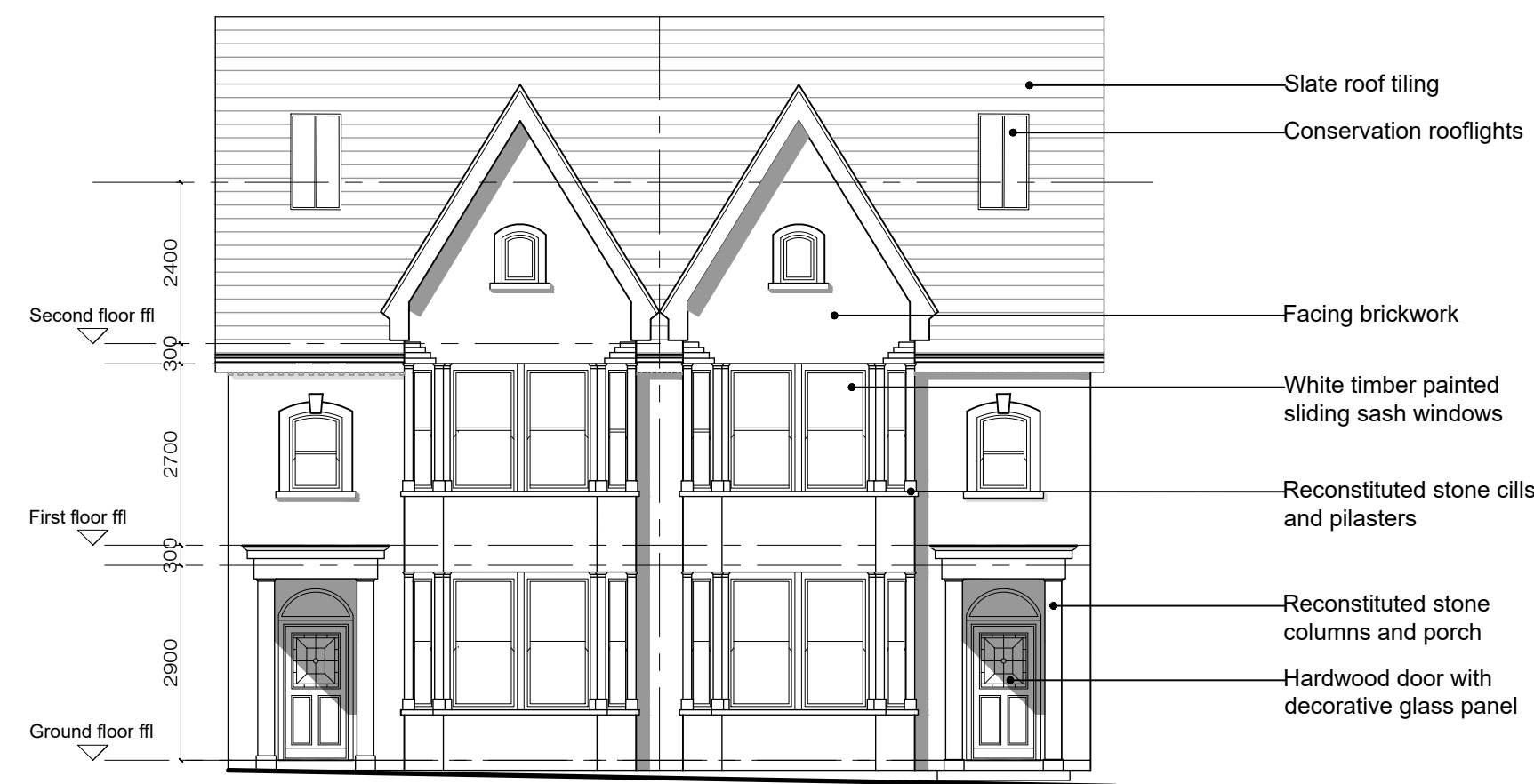
Proposed Front Elevation- 1:100