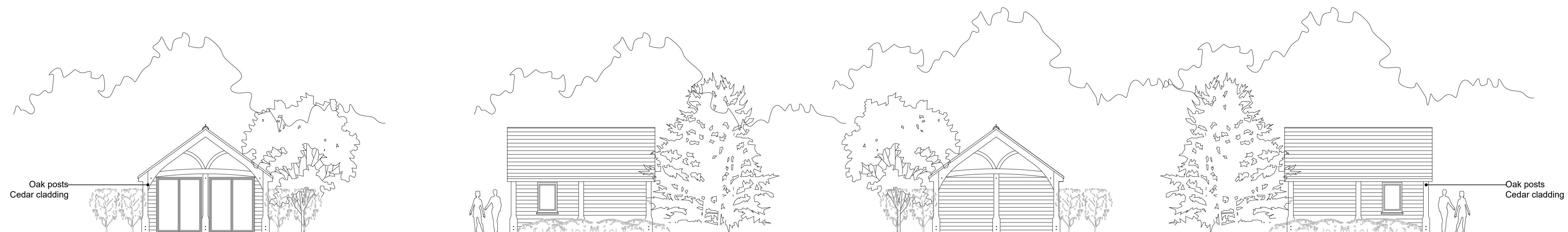
Proposed Garden Room Elevations 1:100