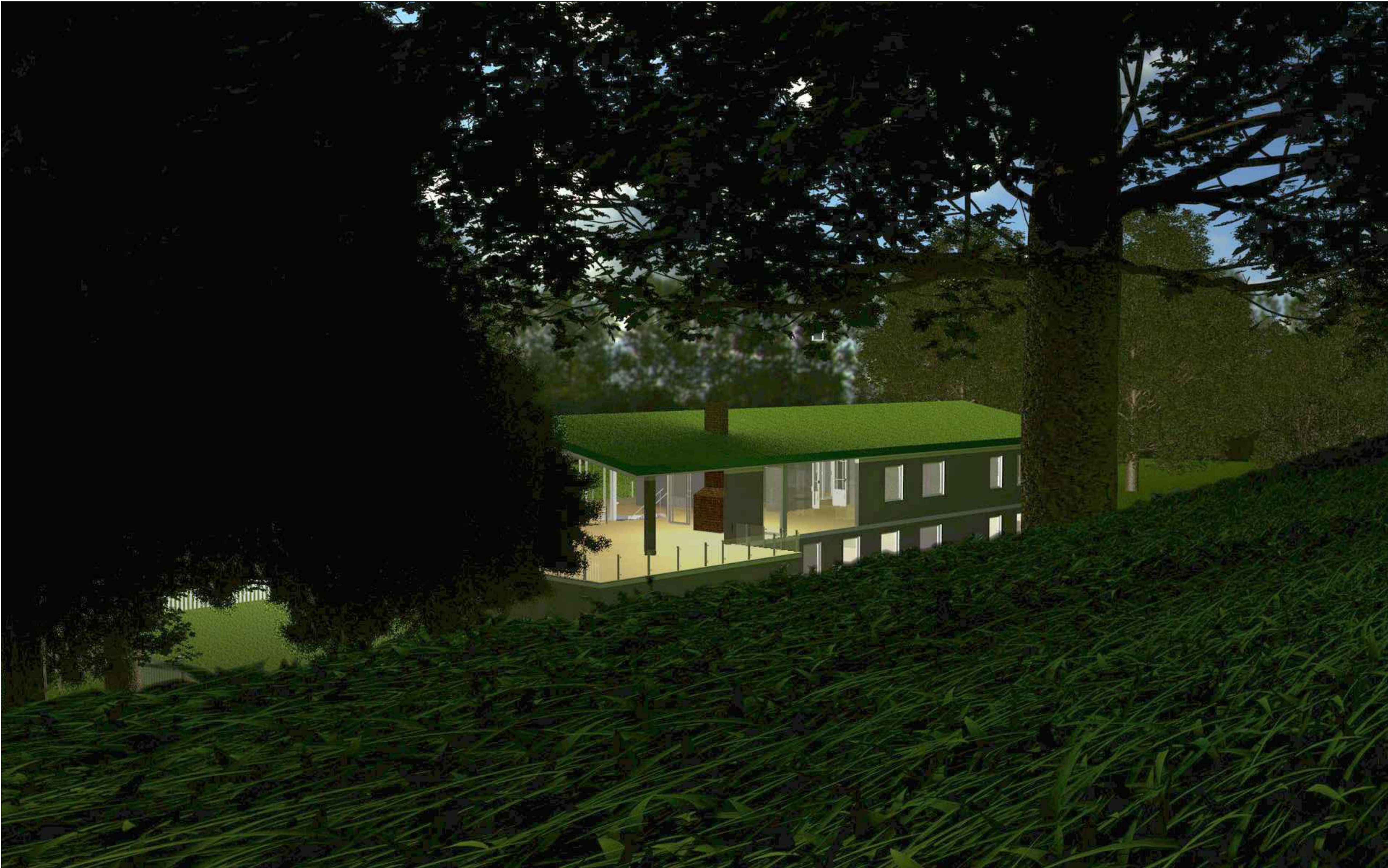
VIEW 1: View from North East

Note This drawing is not to be scaled. Use figured dimensions only. All dimensions are to be checked on site and any discrepancies, errors or omissions are to be reported to the architect prior to commencement of works.