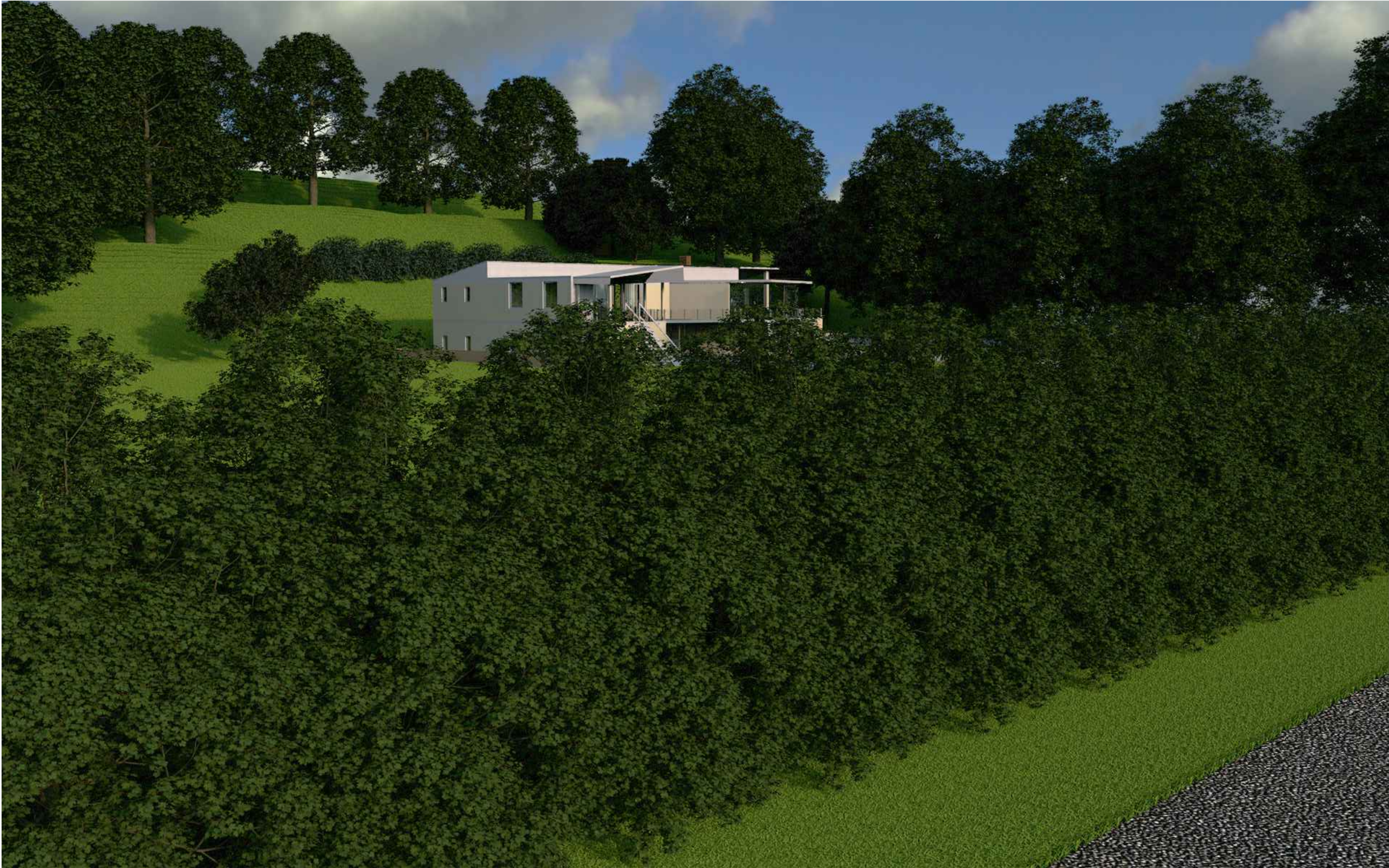
VIEW 2: View from Pudding Lane

Note This drawing is not to be scaled. Use figured dimensions only. All dimensions are to be checked on site and any discrepancies, errors or omissions are to be reported to the architect prior to commencement of works.