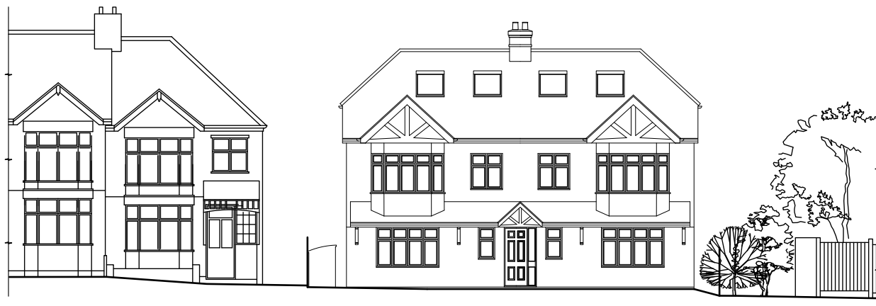
PROPOSED STREET ELEVATION 1:200