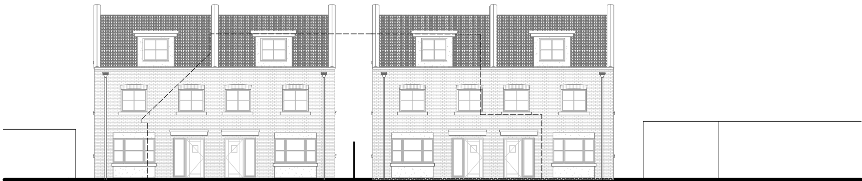
Proposed Street Scene