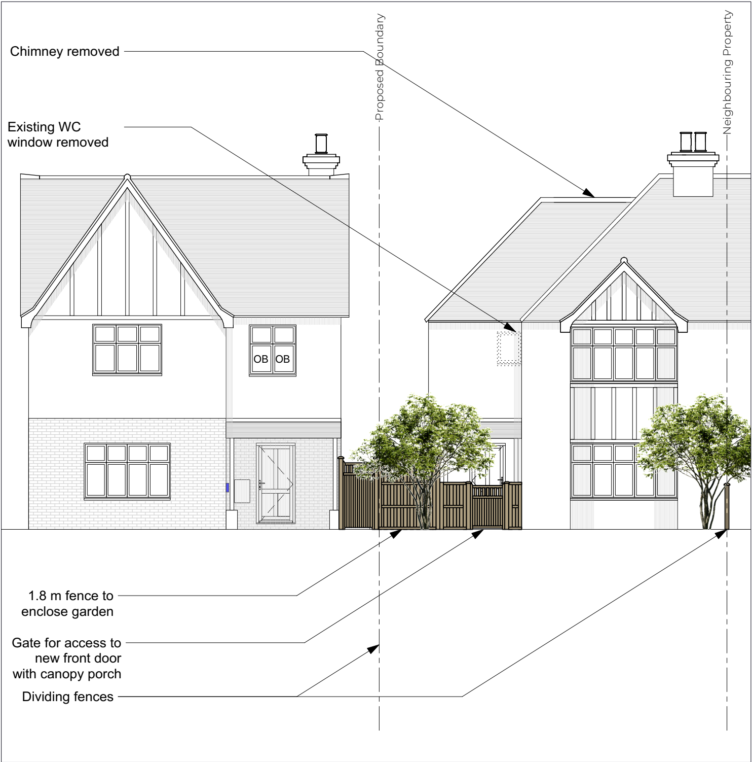
2 Proposed Prior Road Elevation Scale: 1:100