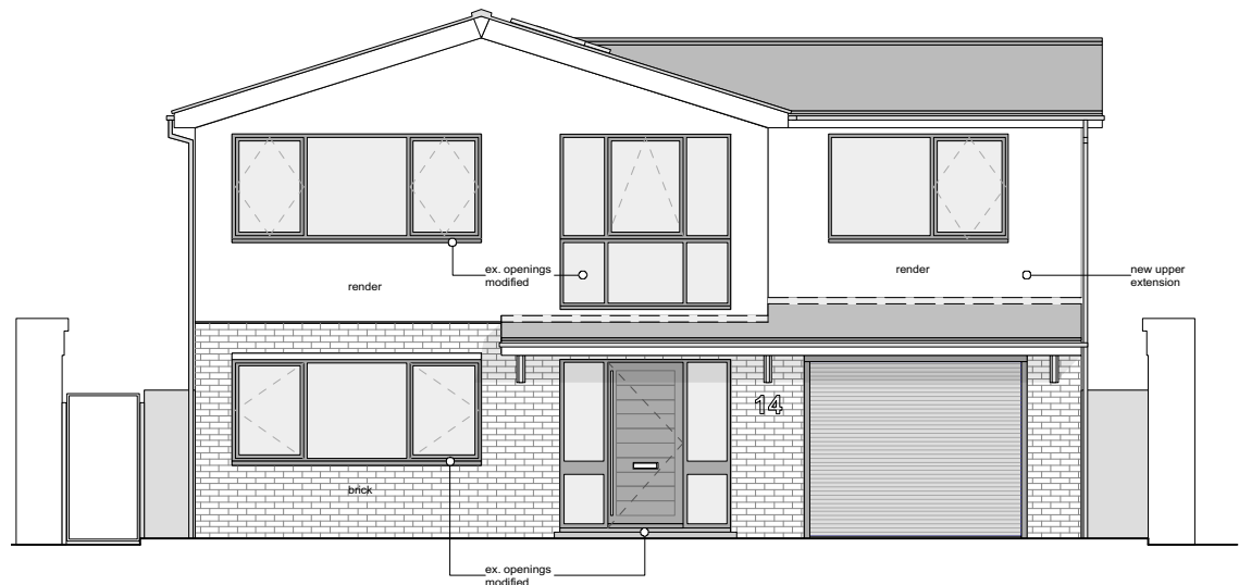
12 Front (Northeast) Scale: 1:100