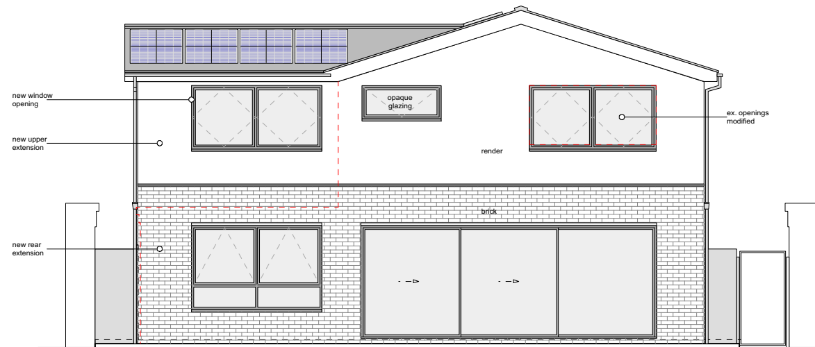
13 Rear (Southwest) Scale: 1:100